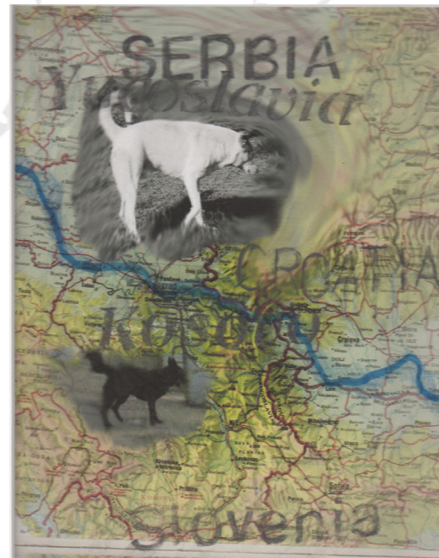
"Balkan Palimpsest #1" 10" x 8" photograph with pencil, marker 2013

Bassis employed a technique of blotting out the text on the maps and later adding photographs taken from her trip to provide viewers with insight into the tumultuous history and centuries of conflict the Balkan region has endured.