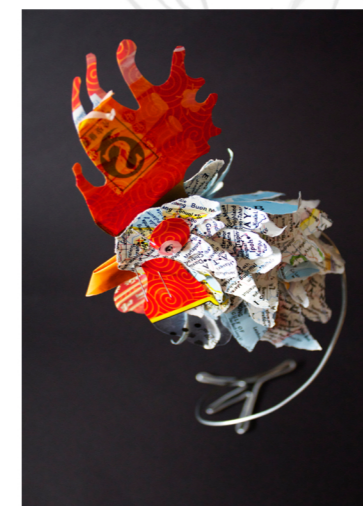
"Rooster 1" 10.5" x 4" x 4.5" paper (map), plastic, wire, metal pins 2013

"Rooster 1" by Wenye Fang reflects personal experiences from a recent trip to the artist's hometown in China.