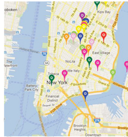
"Awkward NYC/Everywhere" web-based work © Zannah Marsh 2013

The map identifies locations where events such as breakups, arguments, emotional outbursts, physical altercations, overheard comments and romantic encounters have taken place.