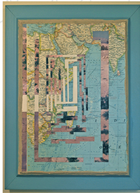
"Silene Colorata" 20" x 17" x 2" paper, wood, paint, styrofoam 2013 Image: © 2005 Mimi Weinberg

Mimi Weinberg's work incorporates photographs taken by the artist in 2005, of vegetation native to the Holy Land.