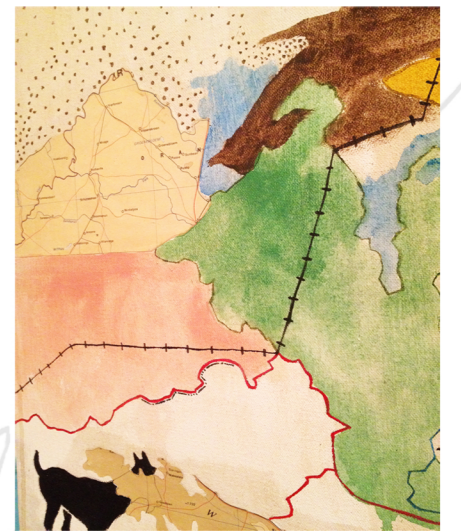
Study for "Sun of the Soil" 12" x 12" acrylic, graphite, watercolor, canvas, wood and found objects 2013

Employing the multi-media technique of assemblage in his artistic process, Smith investigates the psychological, cultural and social implications of colonialism in Africa and the West Indies.