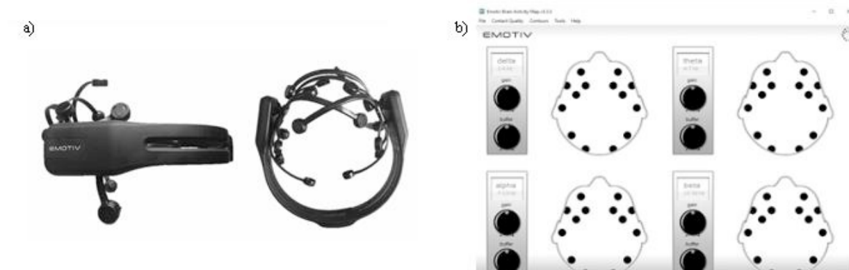
Fig. 1: (a) Emotiv EPOC+ headset; (b) Emotiv Brain Activity Map - application

We used the Emotiv Epoc+ headset, which works with EEG technology. This device was developed by Emotiv system and includes 16 sensors for recording brain activity. The device records the signal at 128 Hz with a sufficient resolution of 14 bits per channel and a frequency response in the range of 0.16 to 43 Hz. The helmet also provides 2.4 GHz wireless data transfer with battery. Therefore, the helmet can capture the brain activity for 8 hours.