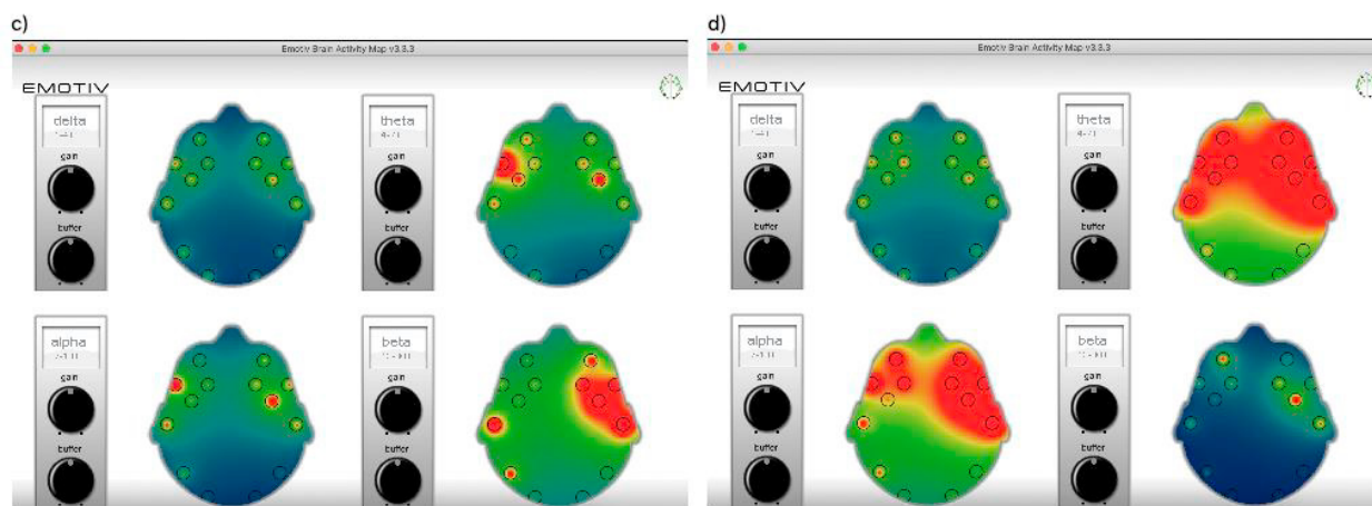
Fig. 4: Brain activity map - a woman (a) Turning right; (b) Turning left; (c) Stopping at traffic lights; (d) Parking