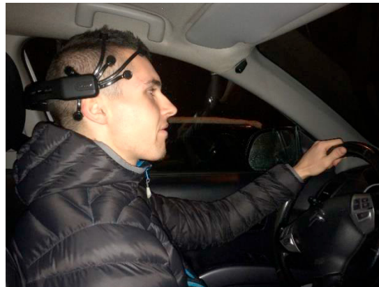
Fig. 2: Measuring male brainwaves

This chapter aims to present the results of measuring brain activity during a driving a car. The results are taken in the application Emotiv Brain Activity Map. The results are not in data form, but as a visualization of brain activity. The spectrum of the colour, from blue to red, signalizes the strength of the signal from the weakest to the strongest.