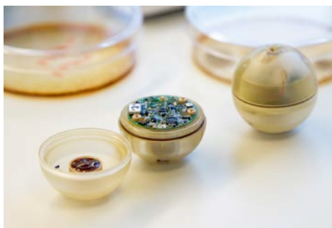
Figure 2. Freely floating sensor particle