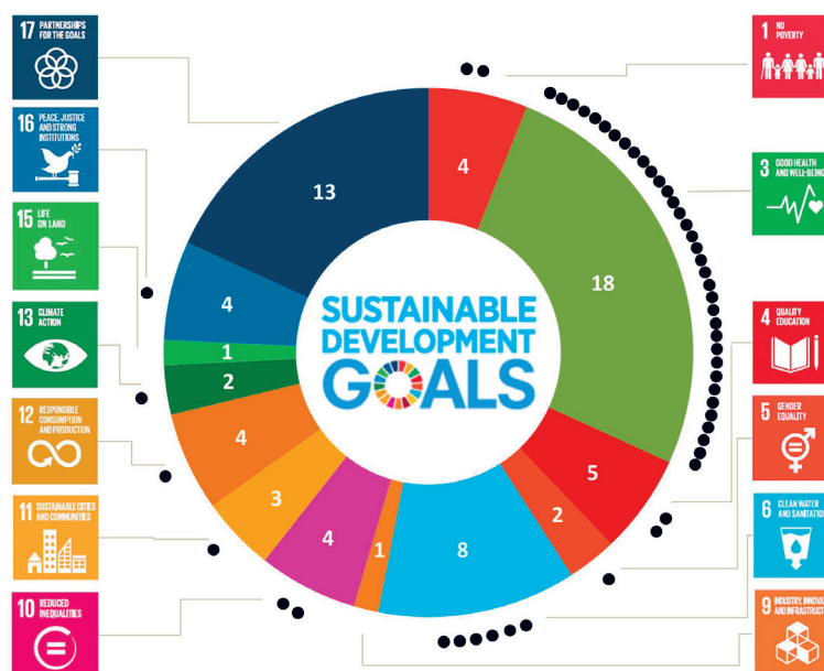
Figure 1. Sustainable Development Goal (SDG)-donut chart indicating the three most important SDGs among the 23 presenters and chairs (n = 23) of a one-day symposium jointly organized by the Swiss Tropical and Public Health Institute (Swiss TPH) and the Swiss Network for International Studies (SNIS), held in Basel in November 2018. The black dots represent the number of votes for the single most important SDG from the audience that participated in the e-poll at the beginning of the symposium (n = 52).

Over the course of the event, two themes emerged: (i) the interconnection of the SDGs and (ii) the need for collaboration and novel partnerships. Hereunder, four challenges became clearly visible and prompted discussions as to potential solutions. The challenges were confirmed by the e-poll at the end of the event, underlining their importance in the 2030 Agenda for Sustainable Development beyond the health-related targets.