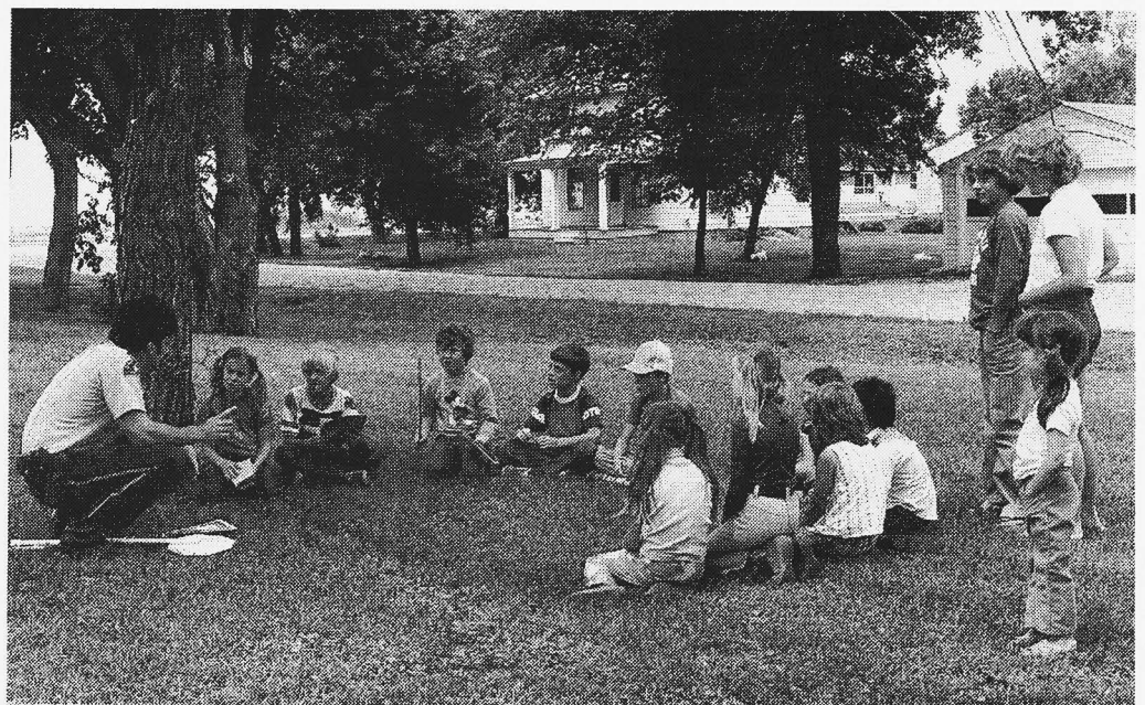
Many people in your community can help teach in day camps.