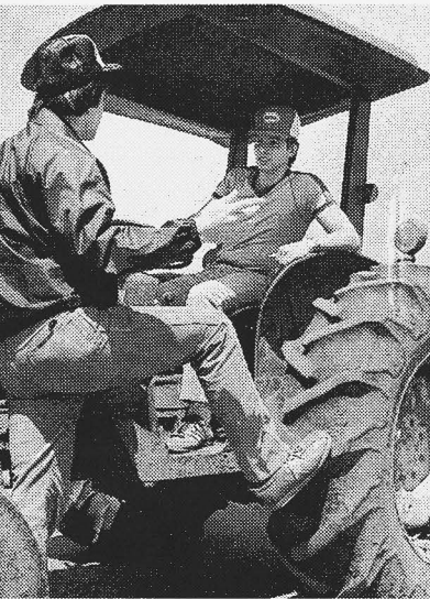
Children who learn safety habits early become safer farmers.