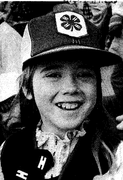
Eight Minnesota farm kids die each year in farm accidents.

Farms are great places for children to play and work. But they can also be places where kids are injured or even killed.