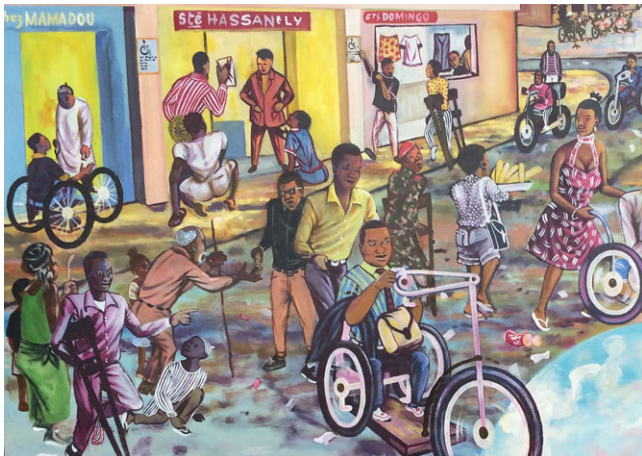
Figure 3. An untitled painting by Kinshasa artist Bosoku Ekunde, 2014. The painting depicts documentaires , or those who beg using documents in Kinshasa. While the artist made the painting at the author's request, he chose to depict the international population from which beggars request donations. From left to right, he shows documentaires begging from people of West African, Asian, and Congolese origin; both beggars and donors point at documents. In the foreground, he depicts individual beggars. [This figure appears in color in the online issue]

dwindling support mirrored the increased dissolution of kinship obligations. While men increasingly could not fulfill responsibilities to provide, women and young people could appropriate existing patterns of authority in new and flexible ways by, for example, disengaging from family expectations and responsibilities (De Boeck and Plissart 2004, 194). Unable to count on patrons or kin, beggars experienced increasing shame and hostility while resources diminished with nothing to fill the void.