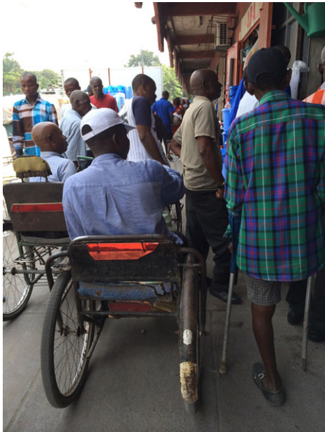
Figure 2. Documentaires , or those who beg using documents in Kinshasa, wait outside a housewares shop while their spokesperson approaches shopkeepers inside, February 19, 2014. [This figure appears in color in the online issue]

imposed their bodies and tricycles to escalate the situation from proposition to demand. They did this, they told me, because too often they were told to come back without result. They would tell the person they would wait, often taking up a substantial amount of the business space (see Figure 2). “Soliciting . . . anticipates a partnership, and thereby creates the position of the donor, as well as prefiguring the act of giving itself,” observes Kostas Retsikas (2016, 4).