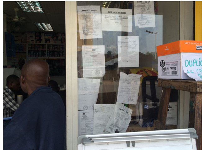
Figure 4. A shopwindow full of documents used by some beggars in Kinshasa, January 28, 2014. In the lower left-hand corner are market tax receipts. [This figure appears in color in the online issue]

The beggars collect donations in much the same way as the state collects taxes, going from shop to shop. The