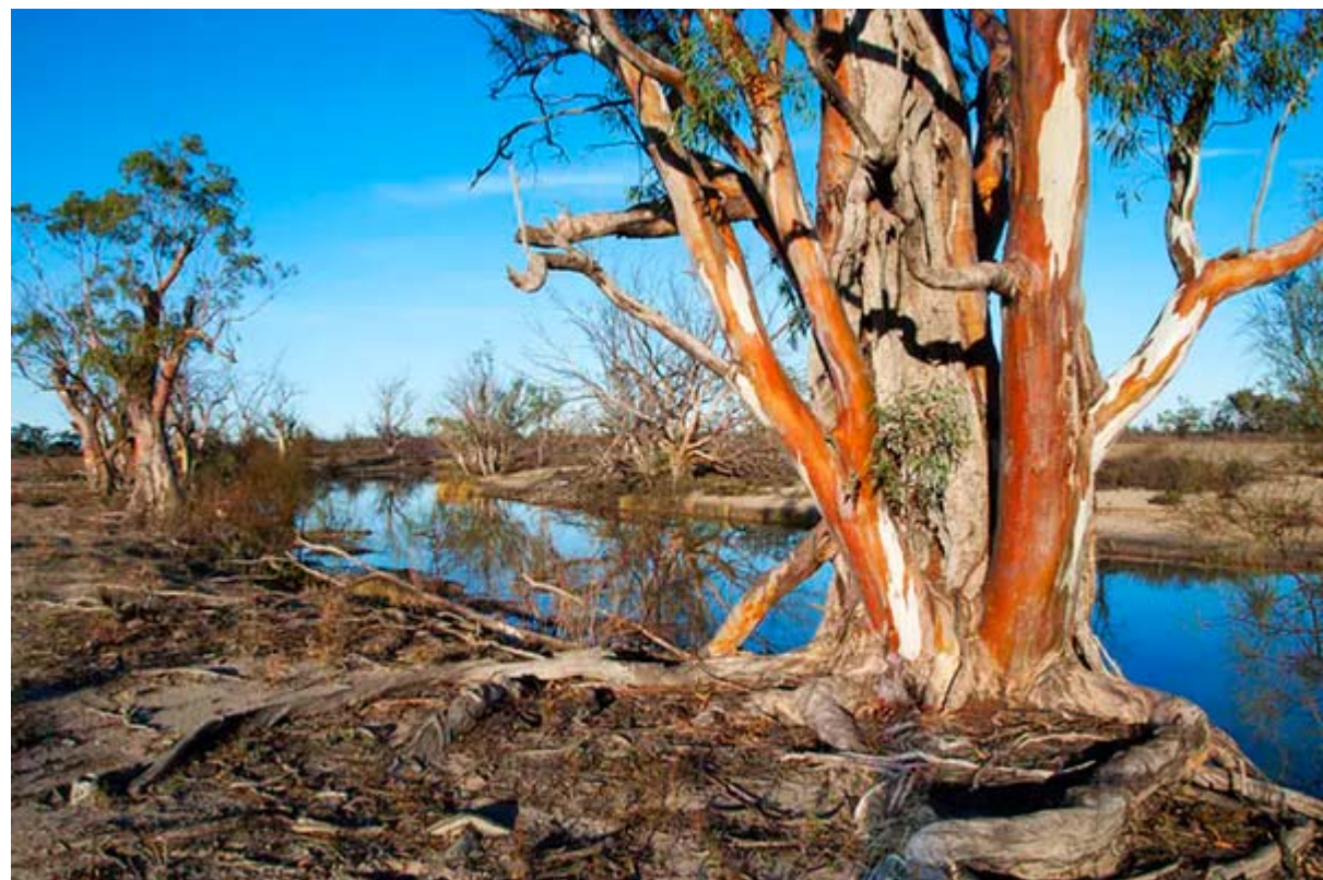
Drought impacts the environment. Ian Overton

The same information could also be used to help forecast the end of drought. This is critical for recovery from impacts.