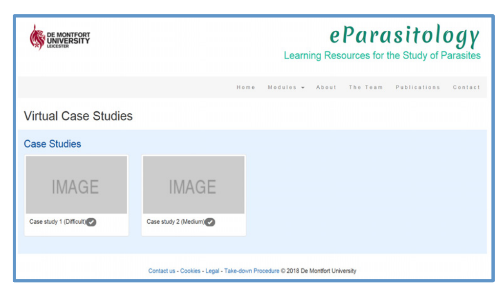
Figure 2. Overview of DMU e-Parasitology's virtual case studies module (Image courtesy of DMU). Available at: http://parasitology.dmu.ac.uk/learn/case-studies.htm

The first virtual clinical case study created involves an HIV positive young male adult infected by the parasites of Entamoeba histolytica and Acanthamoeba spp. and is available here: http://parasitology.dmu.ac.uk/learn/case_studies/cs1/story_html5.html [10]. The virtual case study was developed using the Articulate 360 software. The case study presents a series of clinical slides on the above emerging human pathogens parasites in conjunction with a brief medical history and a combination of tests/quizzes and exercises (Figure 2) with different degrees of difficulty so the user is challenged throughout its completion (Figure 1). The user will use the virtual microscope to morphologically identify the parasite(s) involved. A description of this first virtual case study can be found in Peña-Fernández et al., (2018) [1].