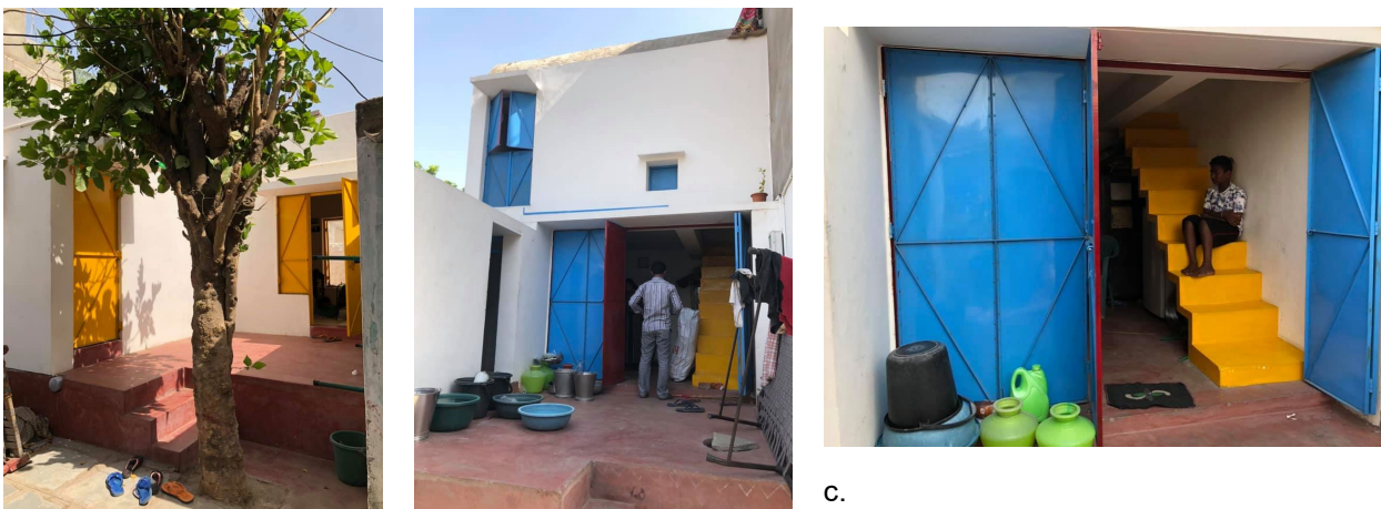
Figure 1. a., b., Interior of existing Old-Houses without any window openings, c. Exterior of Old-Houses