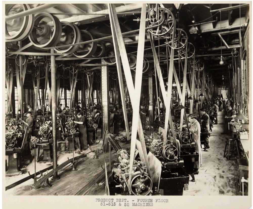
Figure 1 Unknown photographer, Product Dept. - Fourth Floor, 51-515 & 52 Machines, from the National Acme Manufacturing Company Photograph Album, Cleveland, Ohio c. 1915. Baker Library, Harvard Business School.

materials, patent activity, circulation and consumption. This special issue is an exploration of the broader and more material photographic marketplace including raw materials, legal activities, research, patronage, propaganda, and labour relations. It is a call to reinsert the agency of the material objects in order to see the category of ‘photography and industry’ differently.