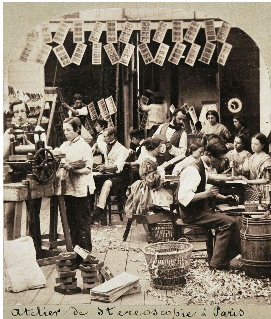
Atelier de Stéréoscopie à Paris