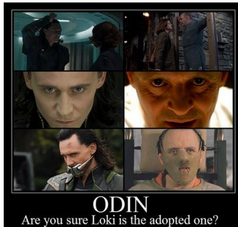
Fig 3.9. The visual and narrative similarities between Loki and Anthony Hopkins' (Odin) most famous incarnation, Hannibal Lecter. 69

screen roles. They are valuable adaptive sites in themselves, moreover, which contribute to his evolving star persona and the creation of new facets of his identity. Memes extend the dramatic lives of their fictional and non-fictional representations, positioning character as the result of conscious and artificial performance in a way that the film text mostly seeks to elide. 68