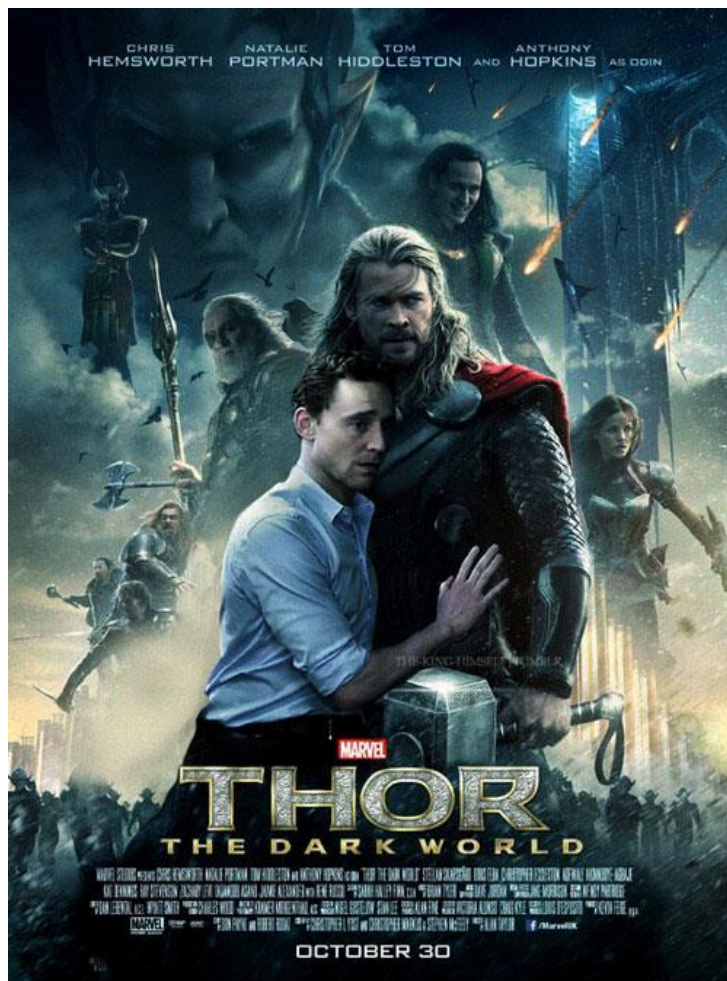
Fig. 3.11 The first example of the ‘accidentally groping’ meme

poster itself (see below) by the Tumblr user, The King Himself, gaining 35,000 notes in the first four days of being online. 74