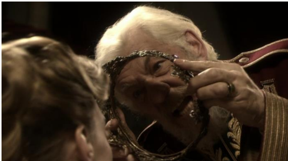
Fig. 1.7 Lear mockingly tells Cordelia of her disinheritance.

is worth torturing. 80 Indeed, this production does not shy away from the implications of an abusive, violent Lear. McKellen's personal play script for the original RSC production of King Lear at Stratford-upon-Avon is peppered with telling comments such as 'bully', 'strong in control', 'still powerful'; there are also references made to a whip as one of Lear's props (although this must have been later discarded). 81 In the subsequent film of this production, the wizened twinkle so beloved of his Gandalf in The Lord of the Rings is present but it is darkened by a calculating quality, wheedling and flirting to get his way. In accordance with Jaques's famous formulation of old age as 'second childishness', he is quick to anger and childishly cruel, hissing 'nothing' in Cordelia's face as he jeers at her through the frame of the crown. 82