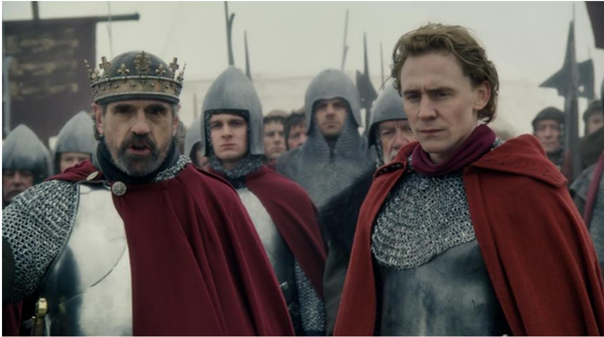
Fig. 3.6 Henry, Hal and the army before the battle at Shrewsbury.

Indeed, in a comparable manner to Thor , much of the ‘Shakespearean’ quality of The Hollow Crown is induced through casting and its mise-en-scène. Witness, for example, the same steely authoritarianism and traditionally patriarchal quality of actors such as Anthony Hopkins and Jeremy Irons. Generic medieval-style costuming, which is recognisably historic but non-specifically so, with emphasis placed on tactile fabrics such as leathers, furs and velvets and coarse homespun cloth, is similarly evocative. The outfit which Hiddleston wears for much of Henry IV thereby accords with this loose, but significant evocation of period and the functional manner of clothing to denote rank: costumes which, operating as a form of mise-en-abîme, reflect the basic nature of the protagonists (as I explored in my section on Thor ). For much of the first part of Part One Hal’s brighter costume of dark red, long-sleeved jerkin, black shirt and thick leggings evinces a recognisably modern and less structured silhouette. This is especially seen in contrast to the formal, highly structural doublet and hose which his brothers wear, who, despite the luxuriousness of the fabrics they wear, are repeatedly dressed in dark, sombre colours with only small ornamentation. Their