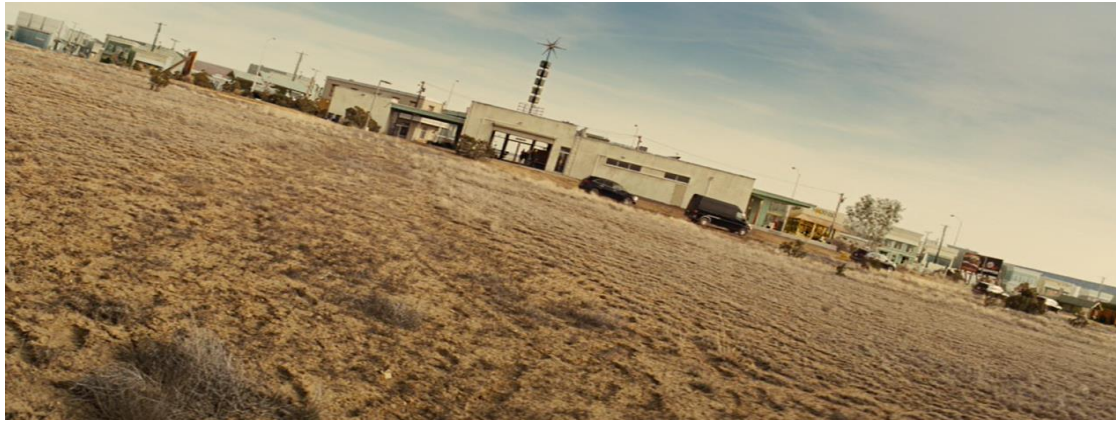
Fig. 2.5 Jane Foster's (Natalie Portman) scientific laboratory in New Mexico

A deliberate, jarring piece of cinematography, it is not configured along 'realistic' lines of vision. The dynamism of this angle is chosen by Branagh to visually replicate the energy and impact of the comic book panels that he remembers reading from childhood. 130 Similarly, Thor is distinctive for its bright visual palette which, particularly when set on Asgard, utilises warm golds, reds and twilit pinks and in New Mexico frequently takes advantage of wide angle establishing shots which encompass the wide expanses of blue sky. With his careful placement of characters (as I will further explore in my chapter on Tom Hiddleston), moreover, Branagh's scene composition often has a tableau-like feel. This references not only his own Shakespearean background but the implicit theatricality of the Asgardian world as well as the curiously static-but-moving quality of a comic book panel. This technique is testament to a practice Branagh acknowledged first as a performer, writing: 'a really good actor will put [...] borrowings into his own soil and make them his own.' 131 In adapting Thor , his desire to represent the energy of the comic book thereby represents not a desire for fidelity, but to create a strategy of filmmaking borne from the unique complications of the