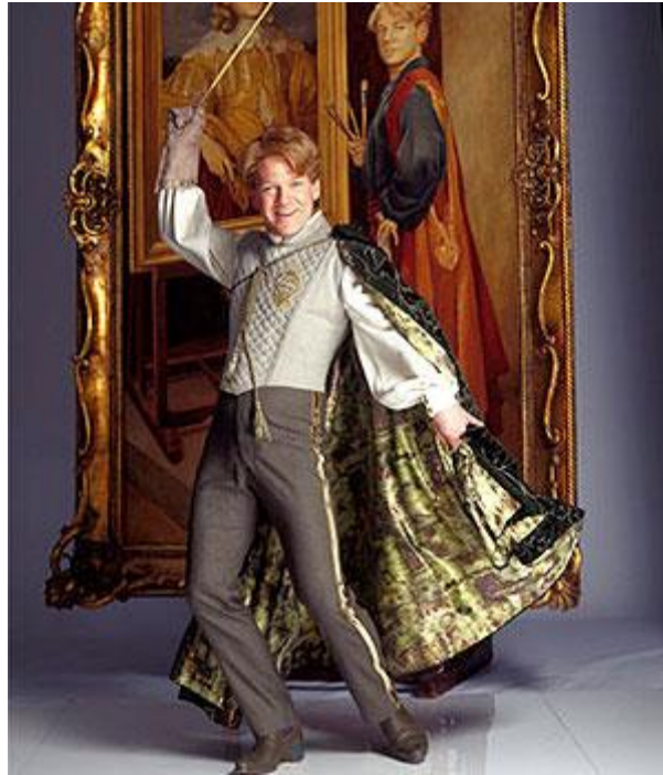
Fig. 2.4 A promotional image of Gilderoy Lockhart, dressed for a duel. 63

Indeed, The Chamber of Secrets recurs with mise-en-abîme demonstrating Lockhart's narcissistic obsession with his self-image. Figure 2.4 (above), a promotional photo, neatly summarises the depiction of the character within the film. Lockhart is stood, wand raised in a heroic action, his hand outstretched, pulling his cloak to the side to give the illusion of movement, accompanied by his personally vaunted, five-time award-winning smile. Behind him is a portrait within a portrait: his first portrait-self stands facing the painter, hand on hip assuming a pose of refined nobility, while in the inner portrait we can see Lockhart's characteristic curls, his period dress perhaps referencing the famous portraiture of the Dutch golden age, such as the iconic work by Frans Hals, 'The Laughing Cavalier' (1624). And, indeed, it becomes apparent by the end of the film that such a flagrant act of creative imposture is entirely in keeping with Lockhart's character: his greatest skill is as a ruthless imitator of those with more talent. Lockhart's celebrated Defence guides — to which he owes