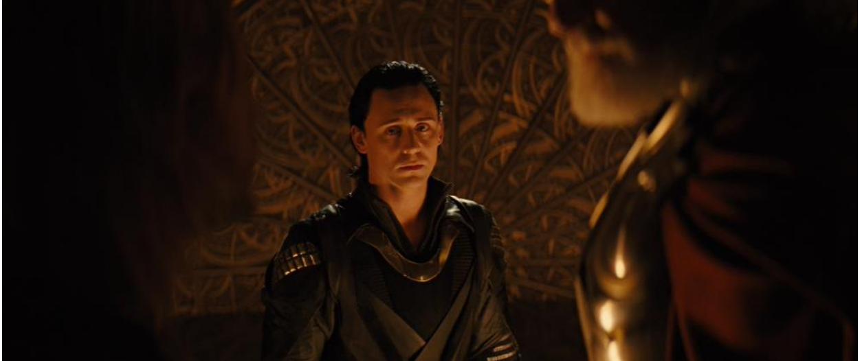
Fig. 3.3 During Thor's banishment the camera cuts from the tight, reverse angle close-ups of Odin and Thor to Loki: one of the 'loved ones' Thor has supposedly betrayed.

figure 3.2 and 3.3 (below), revealing the truth of his machinations: his purposeful manipulation of Thor's pride in order to undermine Odin's trust in his son.