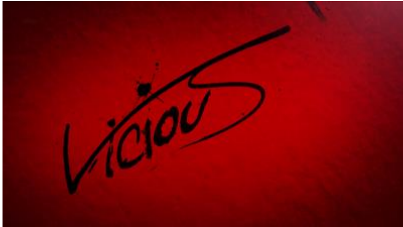
Fig. 1.8 The title page for Vicious

The handwritten credits, with the splashes mimicking the frequent misfires of a fountain pen, gesture towards a form of artistic production frequently utilised in period dramas, in which authorship is aligned with the physical act of writing. Curiously, Vicious thus situates itself within a culture of producing and consuming ‘quality’ or ‘classical’ texts. This is somewhat at odds with the broadness of its situational comedy but aspired to both in the programme’s casting and Freddie’s desperate desire to — ironically — match the cultural cachet possessed by McKellen, Jacobi or de la Tour.