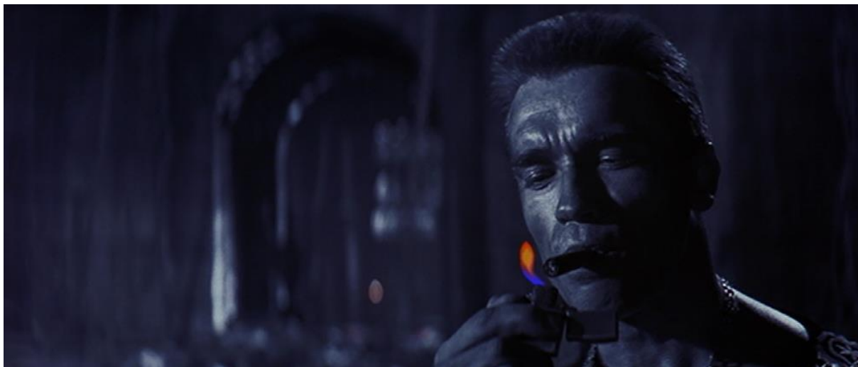
Fig. 0.1 Schwarzenegger contemplates Hamlet's most famous meditation, deciding 'To be or not to be... Not to be. '