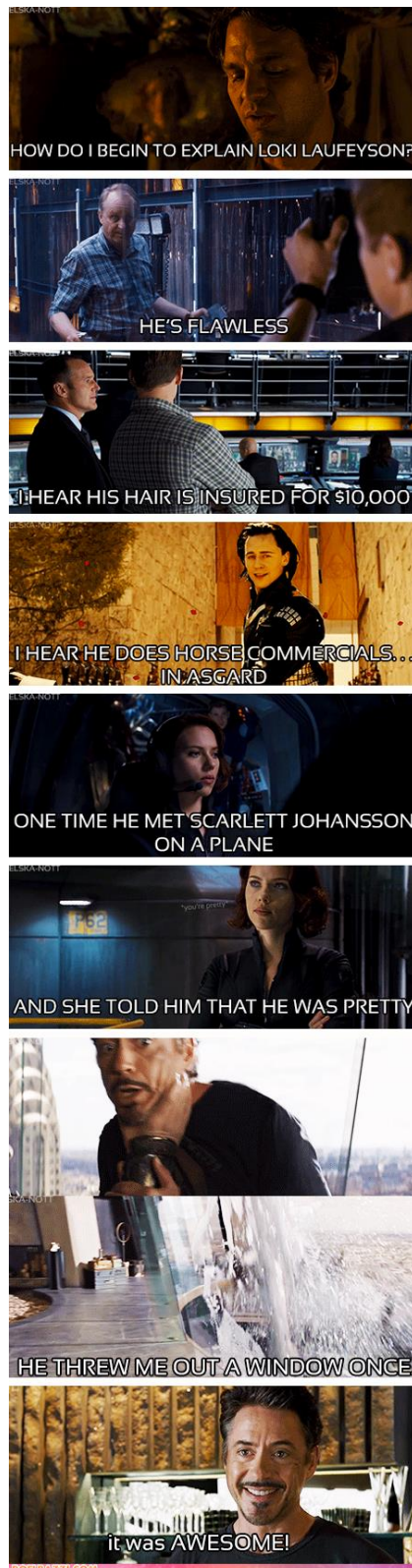
Fig. 3.10 Avengers Assemble/Mean Girls mash up. 71