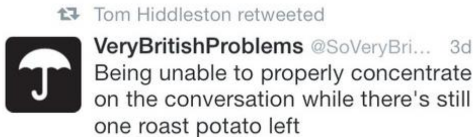
Fig. 3.12 Twitter screen capture from Hiddleston’s account. 78

sense of foolishness and mischievousness. ‘Prance’ similarly alludes to an antiquated idiom that is offset by the light-heartedness of its definition. Finally, as with the Jaguar advert parody, Hiddleston’s endorsement of the Twitter account VeryBritishProblems (@SoVeryBritish) exemplifies his self-conscious performance as an Englishman.