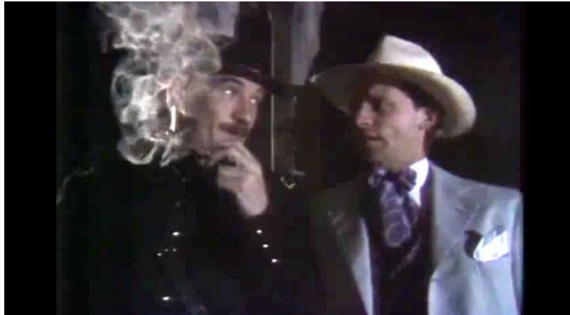
Fig. 1.1 Iago (left) and Roderigo (right) ‘For when my outward action doth demonstrate / The native act and figure of my heart / In compliment extern, ‘tis not long after / But I will wear my heart upon my sleeve / For daws to peck at: I am not what I am.’ 17

the upper class Venetian court, in spite of Iago’s machinations. Unlike Branagh’s Iago who holds a deep (possibly erotic) love for the Moor, McKellen’s outsider is entirely motivated by his contempt and envy of Othello’s social integration. 18