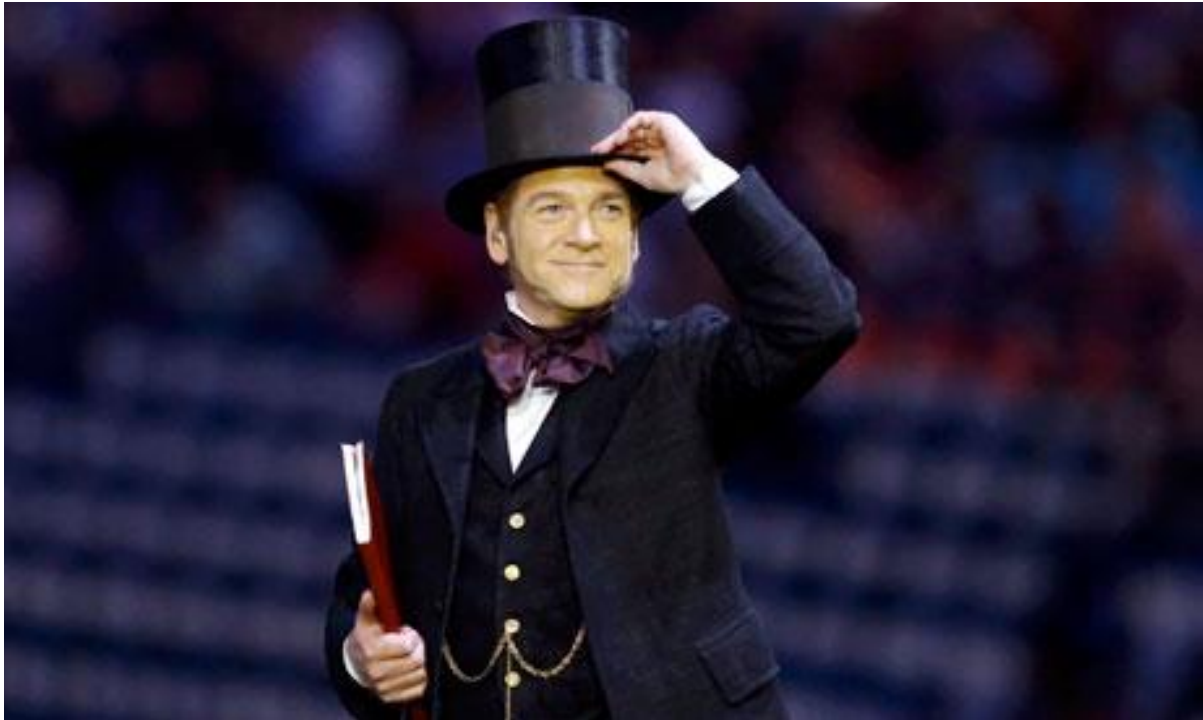
Fig. 2.7 Kenneth Branagh/Isambard Kingdom Brunel/Abraham Lincoln

The impact of Shakespeare's legacy upon Britain's culture was evident throughout the ceremony, appearing frequently in performance and in the staging. Newspaper columns forged out of play quotations, for example, presented Shakespeare's work as familiar, de-contextualised phrases and as evidence of his cultural proliferation. Like Branagh or Spall's star turns, the presence of the quotations enacted a kind of cultural spotting, with pleasure afforded from recognising a 'high' cultural reference embedded within a mainstream event, and accessing the cultural cachet attached to said reference. According to traditional cultural hierarchies, the audience are rewarded for their 'good taste' and thereby gain admission to privileged secondary levels of meaning. Culture spotting thus gives the viewer an illusory sense of ownership through interpretation of both the Ur-text, and mastery over the text in which the reference was 'spotted'; illusory because, like Shakespeare's function within the ceremony as a whole, these quotations are manipulated to suit a particular use. This