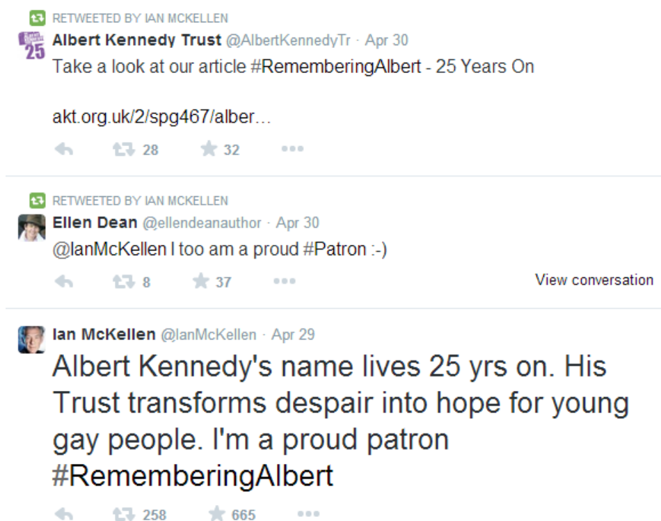
Fig. 1.5 A screen capture of McKellen's Twitter feed. 62

If Magneto represents the deliberate cultivation of transparency between character and actor, connecting that aspect of Ian McKellen's star persona which relates to his work as a gay rights activist, his role as the upper-class, fundamentalist Christian Sir Leigh Teabing in The Da Vinci Code (dir. Ron Howard, 2006) represents the direct opposite. McKellen has long been a vocal critic of the Catholic Church, describing those 'remnants of the patriarchal order' who decide to forgo sexual relationships with others, yet who still have the power to talk about and shape those of others', as 'farcical.' 63 As such, his involvement in the film is unsurprising, perhaps. With its premise undermining the divinity of Jesus Christ by arguing for his marriage to, and child born by Mary Magdalene, the release and subsequent