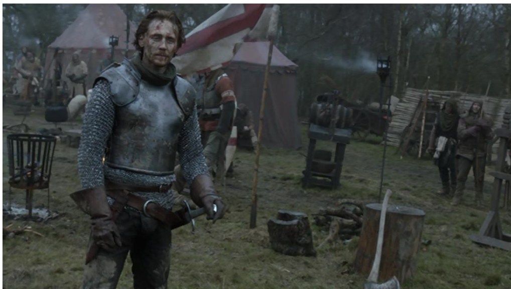
Fig.3. 8 Henry instructs his soldiers to sing 'Non Nobis' and 'Te Deum' (4.8.117).