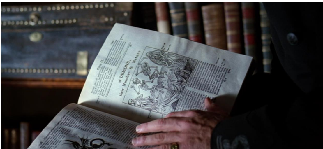
Fig. 2.1 Hamlet's library of supernatural tomes.

As the scene progresses the uncanny robotic stillness of the Ghost is exchanged for more traditional imagery of supernatural horror as Hamlet races through a gothic forest. With smoke rising from the ground, the setting accords with the Ghost's own conceptualisation of hell as 'sulph'rous and tormenting flames' (1.5.736), but also Hamlet's account of 'this witching time of night' as being when 'hell itself breathes out' (3.2.358-9). The Ghost's first seven lines in the scene are then delivered through a disembodied voice with reverberation and distortions placed on the words to further distance the sense of the Ghost having an identifiably human — or once human — form. The Ghost's true existence as a purgatorial spirit would have been anathema to the Protestant Hamlet and the film plays upon this knowledge to offer alternate explanations of what the figure of Hamlet Sr. is, building dramatic tension by delaying the moment of revelation. 53