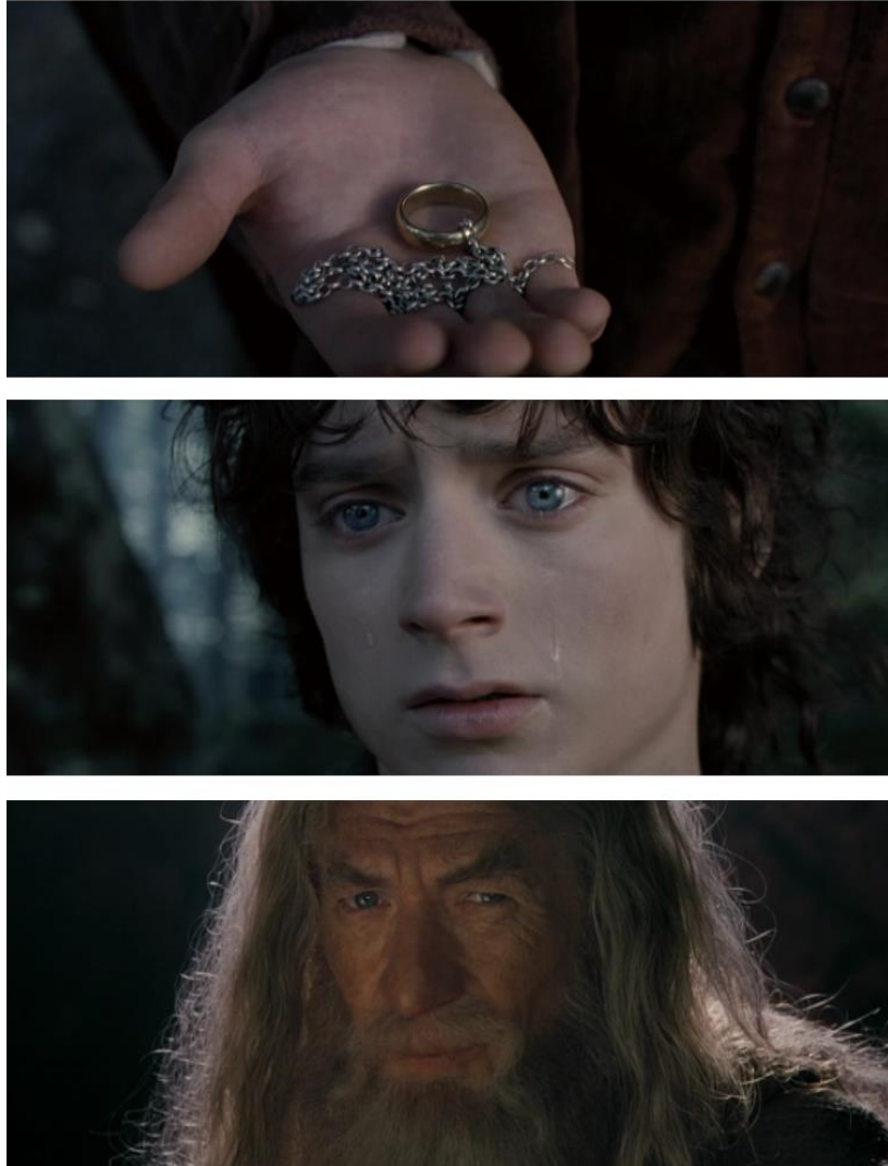
Fig.1. 6 At a crossroads in the narrative and doubting his ability to destroy the Ring, Frodo is comforted by memories of Gandalf's wisdom.

final sequences in The Fellowship of the Ring (dir. Peter Jackson, 2001) in which Frodo (Elijah Wood) stands, deciding whether to journey to Mordor alone, especially demonstrates the quietly authoritative, paternal quality of McKellen's voice.