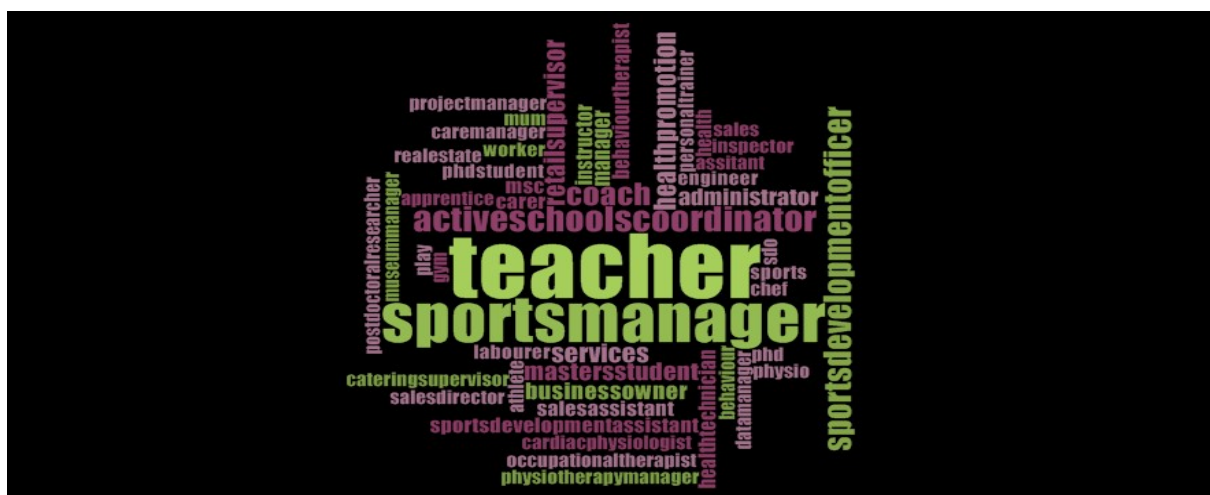
Figure 2: Current occupations of graduates from Abertay sport programmes.

The project output enabled lecturing staff to reflect on curriculum content with regard to preparing students for employment. The demographic characteristics of the graduates in general, did not influence graduate outcomes – however, those who articulated onto their degree programme from college were significantly less likely to progress to postgraduate study ( \chi^2 = 6.35, p < 0.05 ).