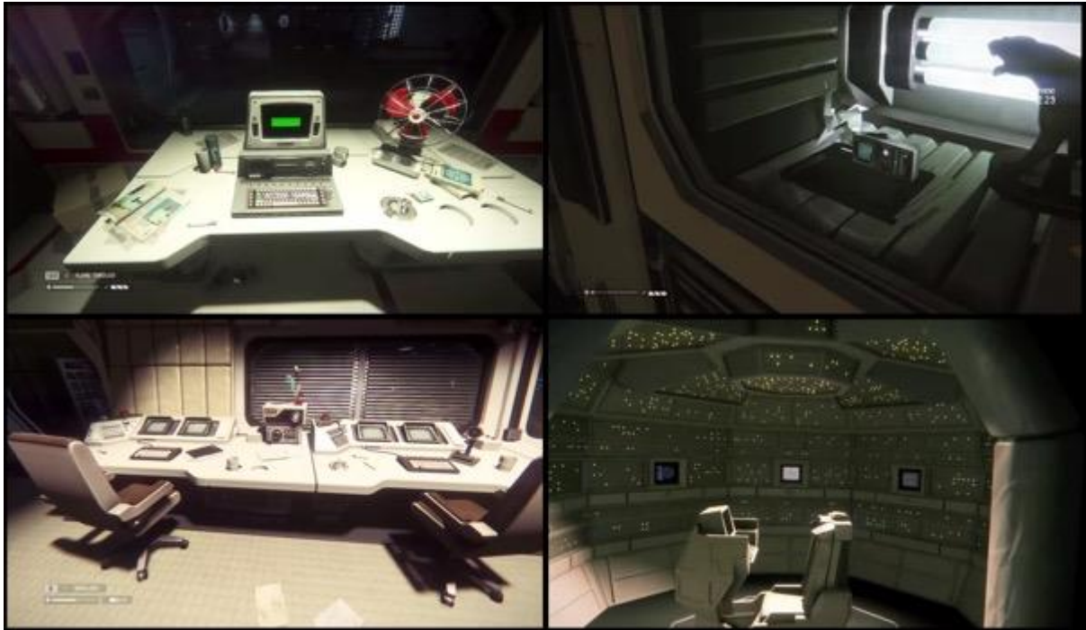
Figure 3: Screenshots captured from Alien: Isolation (various missions).

the unicorn indicates that Sevastopol is a hyperreality: a simulation of fan (both players' and developers') memories of Alien , rather than a direct video game sequel to the original film.