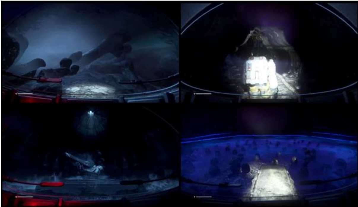
Figure 4: Screenshots captured from Alien: Isolation (Mission 9: Beacon).

As a simulation, then, Alien: Isolation presents a second level of interaction between nostalgic and uncanny aesthetics that we can consider more broadly for video game design. This is perhaps of most immediate relevance to games that fall within the horror and sci-fi genres, given the desire to produce uncanny effects within these games. But there is also a need to consider the fragility of these uncanny effects: drawing player attention too closely to the active simulation of an existing work risks disrupting suspension of disbelief. Alien: Isolation provides an informative example of how production and gameplay design can mitigate the risks of an overly uncanny simulation. It primarily achieves this by identifying the most iconic events, sets and props from the original and related works, and then designing spaces and levels that facilitate player remembrance from an unfamiliar but nostalgically satisfying perspective. In short, it seeks to place the player directly into roles and scenarios that they are familiar with, but have never directly experienced. More broadly, an Easter Egg style approach to nostalgic referencing can be used to create a hyperreal simulation that