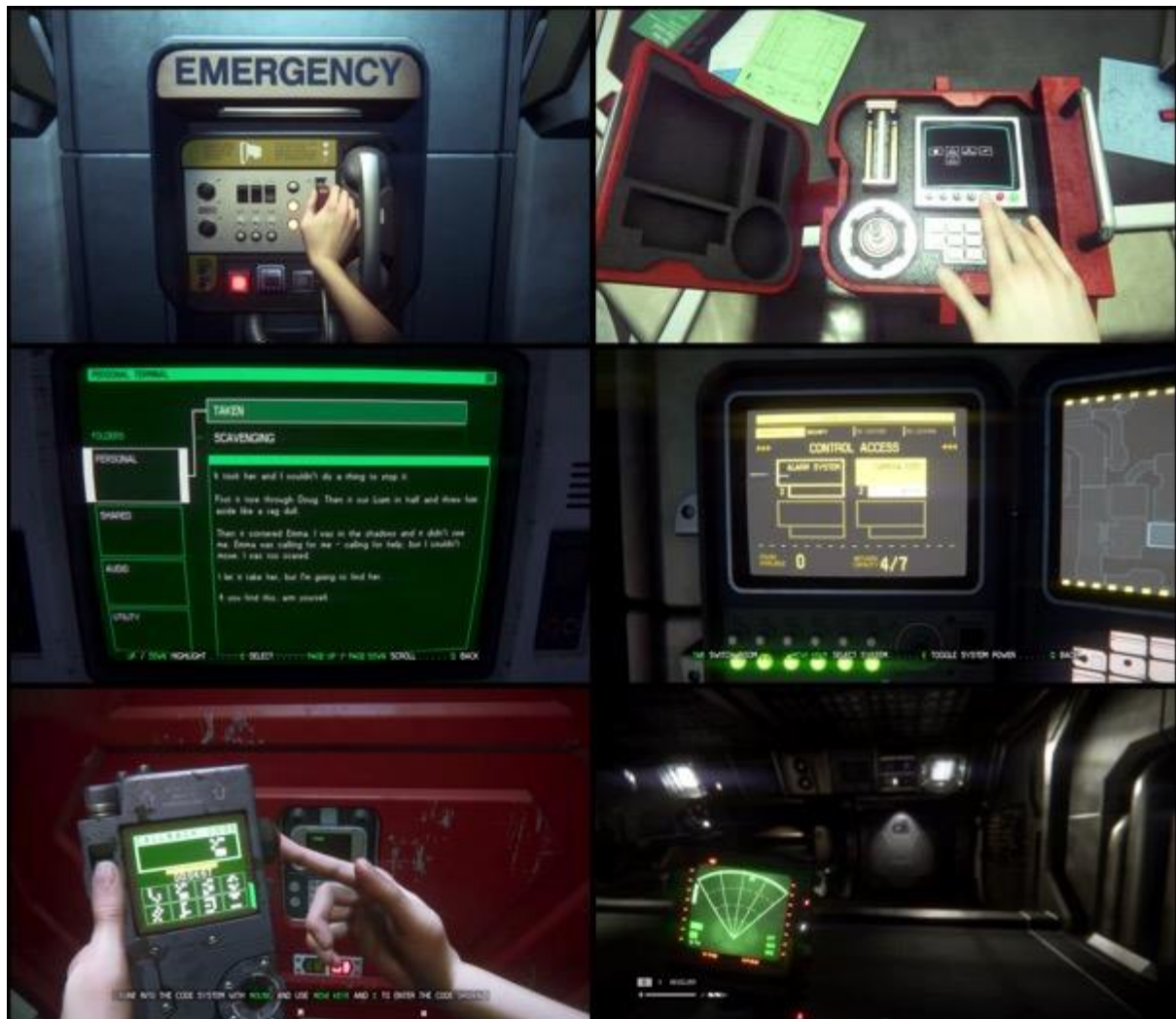
Figure 1: Screenshots captured from Alien: Isolation (various missions).

consumption of period film and television, through handling of electronics owned by older family members, or even through their visits to design and technology museums.