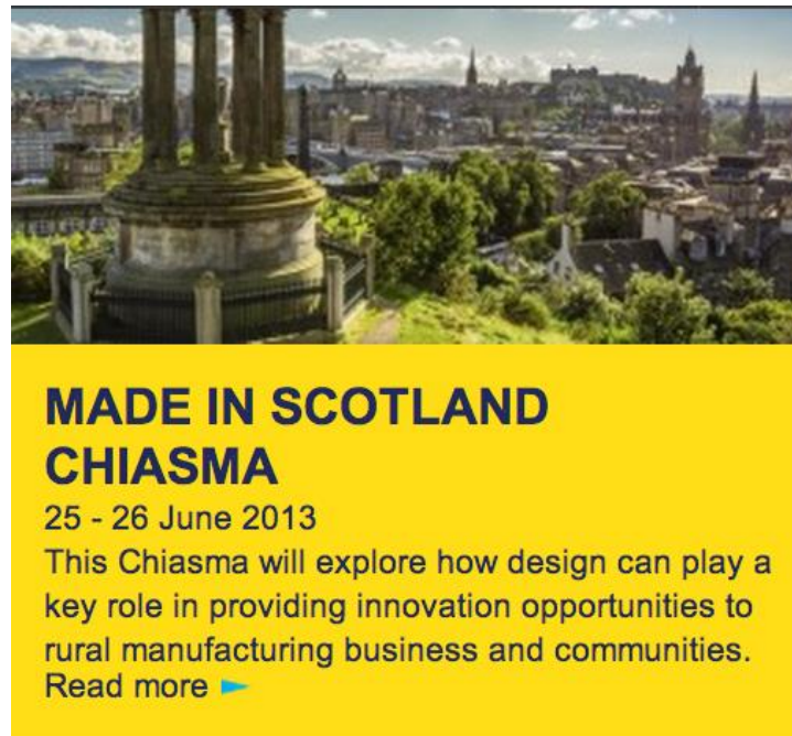
Figure 2: Rural Economy Chiasma Call