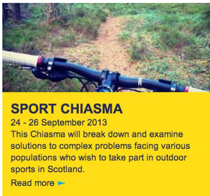
Figure 3: Sport Chiasma Call