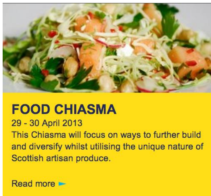
Figure 1: Food Chiasma Call