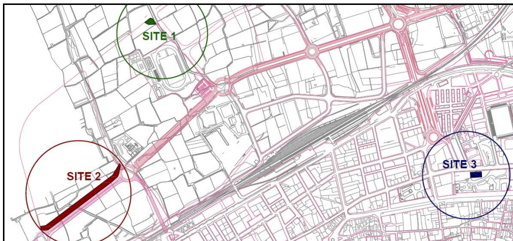
Figure 2. Sites Selected for SUDS in Xàtiva.

Political actors within City Councils have a major influence in the urban planning decision-making of Spanish towns. This fact strongly affects the final outcome of drainage projects and proposals, often resulting in biased processes where other interested parties (citizens, social organisations, etc) are hindered to participate. This is particularly disadvantageous when planning for SUDS, for a high level of stakeholder engagement is required.