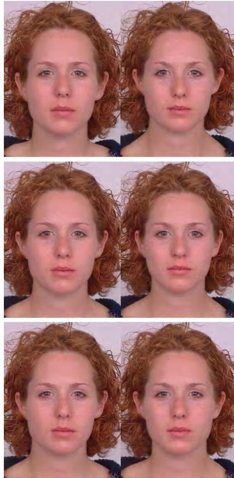
Figure 1. Examples of image manipulation, applied to an adult base face (children's faces are not shown for reasons of consent). Top row: face has been masculinised (left) and feminised (right); middle row: face is original (left) and made more average (right); bottom row: face has been made more asymmetric (left) and more symmetric (right). Image originally published in SAXTON et al. (2009)