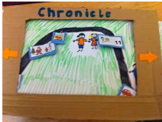
Figure 2 – Second Navigation Mock Up