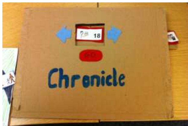
Figure 1 - First Paper Mock-Up

At the sprint review the user advocate presented this feedback to the SCRUM team and suggested that they could start on initial prototypes. There were concerns by the rest of the SCRUM team that linear stories would prove confusing when a large number of stories were entered into the system. While the user advocate was clear that this was what the users had requested she agreed to the team's request that this issue was carried into the next sprint and paper mock-ups were produced to ensure that this method would really work for the users.