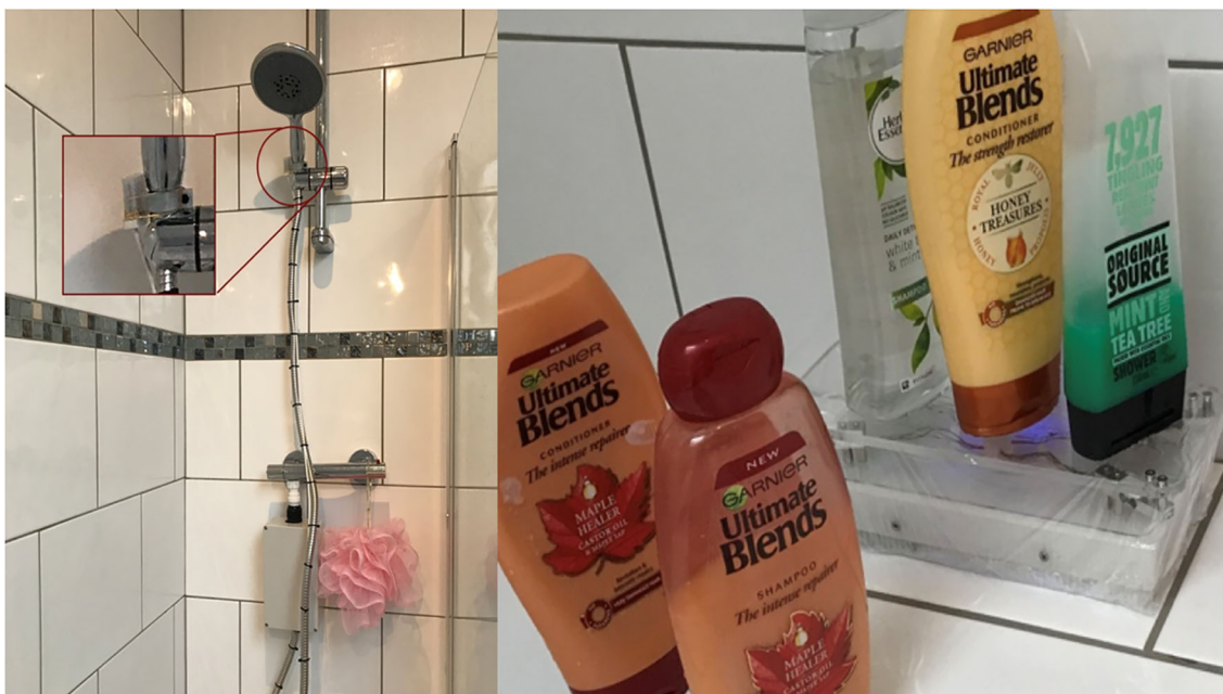
Fig. 2 The connected shower in situ