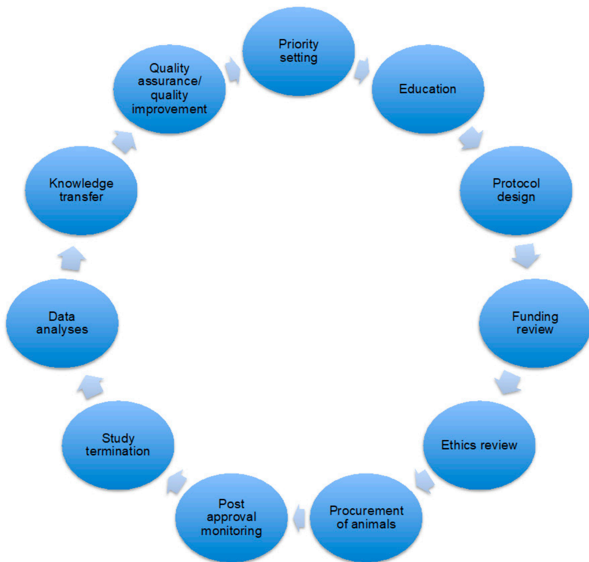
Figure 1. Proposed virtuous, self-reflexive learning loop for animal-based research that would focus on ethical reflection. Ethical reflection would no longer be limited to the ethics review component (adapted from [38]). Animal manipulation occurs from the procurement of animals to the study termination, so it represents a relatively small part of the process of animal-based research.

Participants generally agreed that increased openness would help to raise standards by allowing greater cooperation between researchers and the institution: “I do think the evidence is available, but it means you’ve got to have enough openness so that you can try and bring it out and hold it up to scrutiny.” This encourages the creation of a system that ‘learns’ by having a continuous feedback and evidence-based accountability: “We have to prove that this system works in a way and to produce the evidence for it.” Participants recognized the importance of building an ethical culture but also recognized the importance of being clear that this is a learning process and the system will be refined over time. To achieve this goal, cooperation and commitment are needed from all stakeholders within the institution and research community. Elsewhere, it has been noted that openness alone will do little to improve ethical decision-making in animal research [39]. However, as indicated by the workshop participants, an institutional commitment to building an ethical culture of research requires increased openness, not only at the protocol review committee level but at all levels that make up the system of animal research.