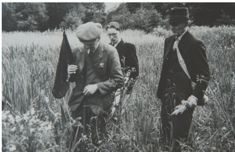
Figure 1. “Strensall Common” taken in 1944. This view shows three entomologists engaged in daytime field collecting. During the Second World War, blackout regulations restricted night-time collection of Lepidoptera.

The Dark Bordered Beauty moth Epione vespertaria (Lepidoptera, Geometridae) is a Red Data Book species (Shirt, 1987), currently only known from a single English site, Strensall Common, about 10km north of York (Baker, 2012; Baker et al. , 2016). Publications mention Yorkshire as a locality for Dark Bordered Beauty in the 1820s (Stephens, 1829), York itself is mentioned by the 1860s (Walker, 1860) and specific sites around York are mentioned by the 1870s (Anon, 1878). Initially the most mentioned site was Sandburn (e.g. Porritt, 1883), along the Malton Road (A64), but later the adjacent site of Strensall (Figure 1), to the west of Sandburn, became better reported (e.g. Hewett, 1900). The moth was also collected at Askham Bog, to the south west of York in 1893 by S. Walker & R. Dutton, and again in 1898, but this fact was generally unrecognized until recently (Mayhew, 2018).