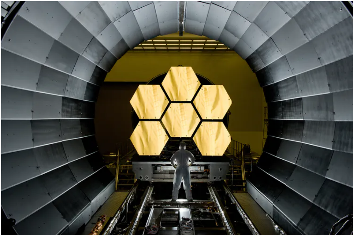
Primary mirror of the James Webb telescope.

But why do we need such structures? Take the case of the James Webb Space Telescope, which will soon replace the hugely successful Hubble Space Telescope. It boasts a large primary mirror that is protected from the sun by a shield the size of a professional tennis court. In order to fit this technology into an Ariane 5 rocket, both the primary mirror and the sun shield comprise of deployable segments. These then require a complex sequence of individual releases to fire on cue once in space – or risk mission failure.