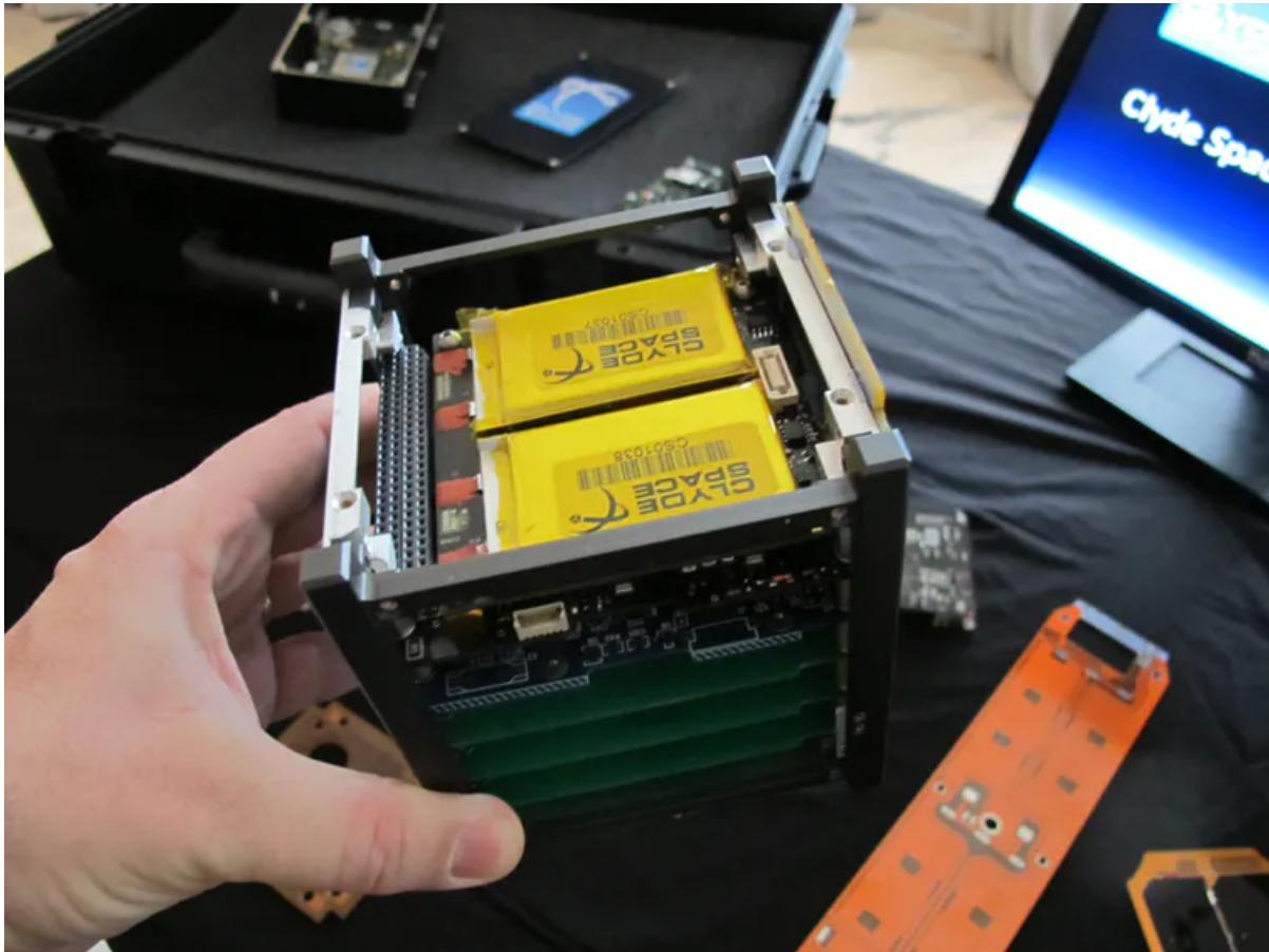
CubeSat in hand.

Miniaturisation of technology has enabled a range of spacecraft sizes, such as the 100kg small satellites used for the Disaster Monitoring Constellation, which consists of a coordinated group of individual satellites. There are even compact 30x10x10cm CubeSats, satellites weighing a few kilograms, which can carry a range of different payloads. These are often used for Earth observation or to conduct low cost science experiments, since a large number of them can be launched as secondary payloads along with larger satellites.