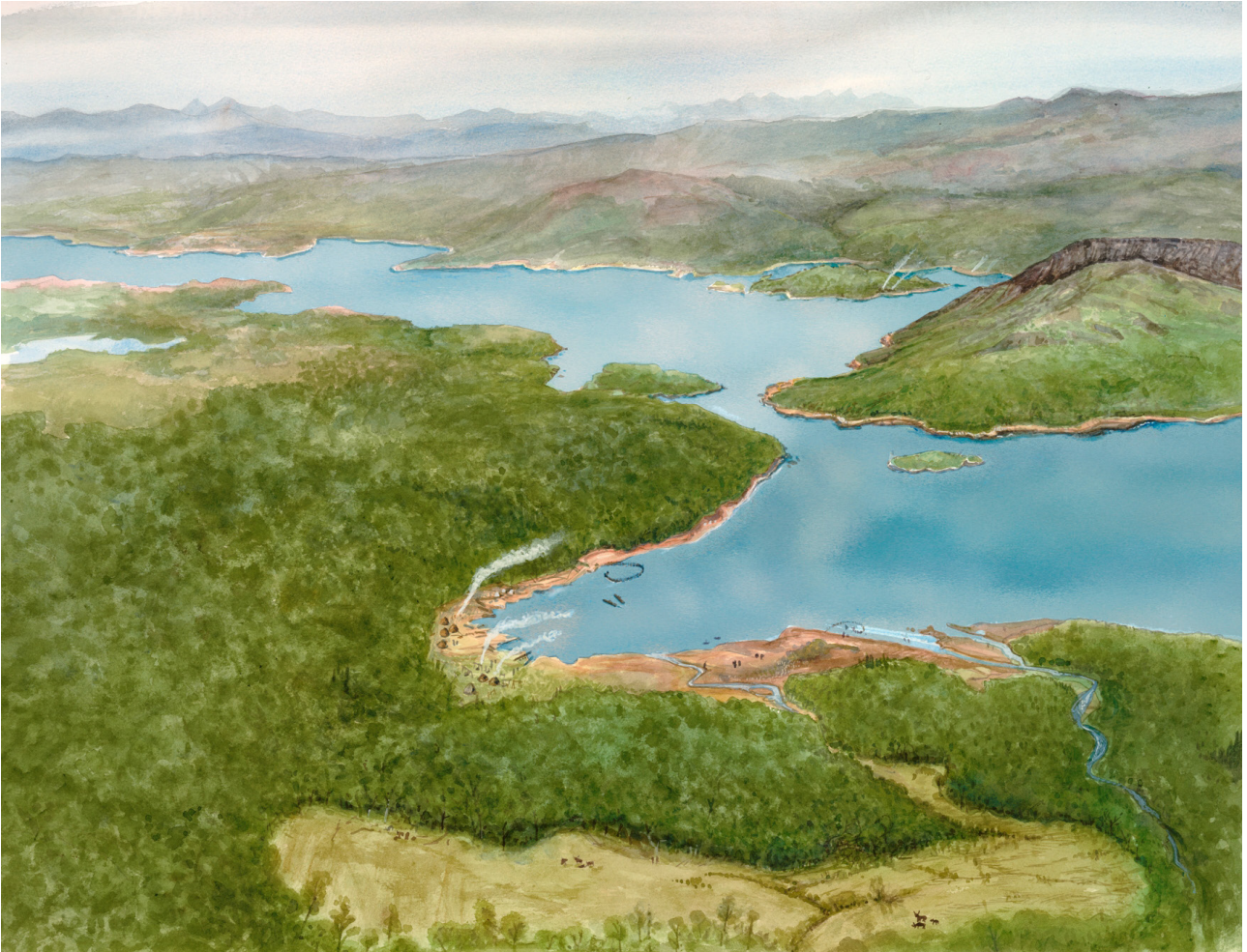
Illus 5 Illustrative drawing (© FCS by Dave Powell)

2008; NMRS no.:NG64NE 5) and further afield, as at Oliclett, Caithness (Pannett & Baines 2006; NMRS no.:ND34NW 43). These are all Mesolithic sites where barbed and tanged arrowheads and other Bronze Age knapping episodes are documented. North Barr River contributes to the growing body of evidence documenting certain types of Bronze Age activity taking place at such previously favoured locations in the landscape, perhaps part of wider deliberate practices of earlier site reuse also seen in the first millennium BC (for example Hingley 1996; Lelong & MacGregor 2007).