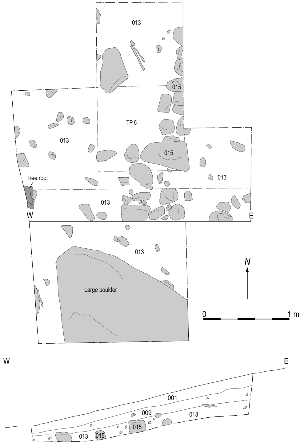
Illus 3 Excavation plan and section through Trench 5

The concentration of sub-angular and sub-rounded boulders and cobbles (D015) was revealed further, and some sat completely or partially upright within D013 (see Illus 3). The concentration of stone appeared to curve slightly from a north/south orientation round to the south-south-west and headed towards a very large boulder that had