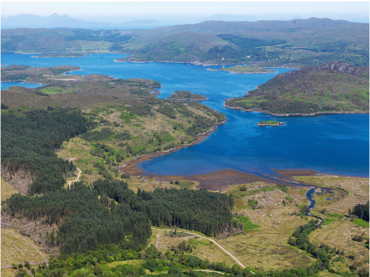
Illus 4 Aerial photograph, North Barr River site in centre

The overall impression is of an extensive background lithic scatter in which several discrete phases of Mesolithic and later activity are represented. The closest Mesolithic site is that of Barr River (Mercer 1979; NMRS no.: NM65NW 5). It is clear that here the artefacts were present in hill wash, and some clearly derived from further upslope and in rather rolled condition. Test excavation did not recover in situ remains. Detailed information is limited but the assemblage of around 80 pieces was also heavily patinated or burnt. Four geometric microlith fragments and a