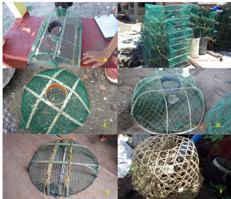
Figure 2. Different shapes and sizes of crab pots found from the different crabbing municipalities in the region: (A) Bombom, Catbalogan; (B) Yangta, Daram; (C) San Antonio, Basey; (D) Pangdan, Catbalogan; (E) San Jose, Tacloban; and (F) Naungan, Ormoc

Table 5 lists the different types of crab pots used in some crabbing municipalities in the region. Based on the survey, crab pots in Leyte and Samar come in different sizes and shapes (Figure 2). Crabbers in San Pedro Bay, Maqueda Bay, and Leyte Gulf use 30 to 60 units of pots per line in one operation.