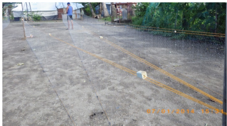
Figure 4. A crabber fixing a bottom set gill net in San Jose, Tacloban City

Crabbers using crab lift nets usually use non-motorized boats. The gear is also easy and cheap to maintain compared to the pots. Some of the crabbers in the region prefer lift nets over pots because the gears are cheaper, lighter, easy to construct, more easily stacked on deck, and occupy less space as observed