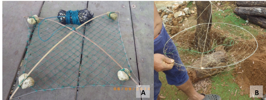
Figure 3. Types of crab lift nets: (A) the traditional crab lift net made of bamboo slats, polyamide netting, and frame; and (B) the modified crab lift net made of tie wire, nylon netting, and polyethylene rope

Commonly used baits are trash fish and bivalves such as slipmouth, green mussels ( tahong ) and brown mussels ( piyong ). Crab pots are usually deployed in waters 8-20 m deep. Setting operation varies according to location, water depth, and the number of pots used. Soaking time usually lasts from 10-12 hrs depending on the season. The crabbers usually deploy their pots at around 5:00 p.m. and haul them at around 4:00 to 5:00 a.m. the following day. Some crabbers in Catbalogan do multiple harvests within a day by alternately setting and hauling their pots. However, they have to own at least two sets of 30-70 pots to do so.