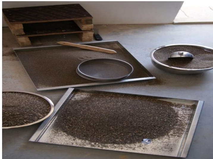
Figure 2: Sieve Analysis for Fine and Coarse Aggregates [18].

Well-graded aggregates of size less than 20 mm, with a specific gravity of 2.81 were obtained from a local supplier. The particle size of both fine aggregates and coarse aggregates were checked through the sieve analysis (ASTM C136) as shown in figure 2 [18].