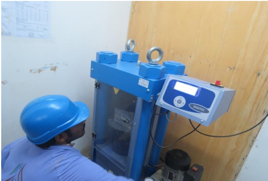
Figure 4: Compaction Test of Different Cube Trough Compaction Testing Machine (BS 1881-116:1983) [19].

After properly curing the prepared concrete cubes for seven and 28 days in the water tank, were then tested for compressive strength through a compression testing machine as shown in figure 4 (BS 1881-116:1983) [19]. The average value of compressive strength was recorded. It was noticed from the results that there is steep growth in compressive strength with the addition of ceramic powder. This is possibly because of the silica content present in the ceramic powder. Beyond 30% replacement, there is a decrease in strength. This is possibly because of less amount of cement in the mix. Based on this statement it can be concluded that a 30% replacement is optimum. The results are presented in Figure 5. It can be observed from the figure 5, that the compressive strength of concrete having ceramic waste powder of up to 40% reduced from 36.95 MPa to 25.9 MPa, which is, however, meeting the minimum requirement of the compressive strength for this grade of concrete. This, however, indicates that increasing the ceramic waste from more than 30% will result in a reduction in compressive strength. Although it is observed that the variation of ceramic waste can change the strength of concrete, however, the chemical composition of the ceramic-waste can play a significant role. A ceramic waste with a different chemical composition will defiantly give a different strength of concrete.