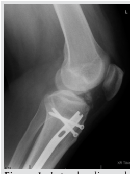
Figure 1: Lateral radiograph showing ossified fragment before arthroscopy.