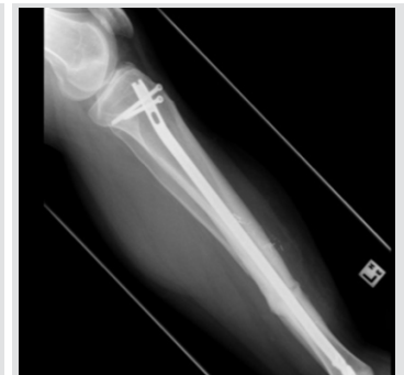
Figure 3: Radiograph following removal of fragment and progression to union.

Radiographs demonstrated an intra-articular bony fragment (Fig. 1). Arthroscopy was performed which showed a bony fragment impinging in the anterior aspect of the knee joint blocking full extension (Fig. 2a and b). The fragment was removed arthroscopically and his symptoms completely resolved (Fig. 3).