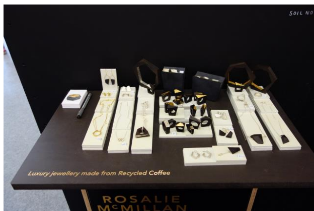
Figure 7: Jewellery made from recycled coffee

On a smaller scale there are various companies which have developed innovative ways to use waste produced from coffee to create other products. For example, Huskee Cup have created a range of cups that use the coffee husks in the creation of coffee cups (Huskee, 2017), and jewellery designer Rosalie McMillan has created a collection of jewellery using coffee grounds (McMillan, 2017).