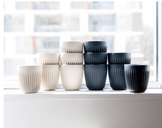
Figure 8: Huskee Cups

A different business model for the use of coffee grounds has been developed by the Dutch company Rotterzwam, which created an initiative called 'Coffee as a service', currently being tested with businesses based in Rotterdam. Customers lease roasted coffee from the company to use it, then Rotterzwam collect the waste coffee grounds for use in various products, such as mushroom growing kits and bioplastics (Brown, 2018).