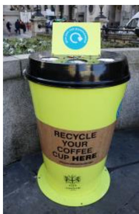
Figure 2: Coffee Cup Recycling

There have been other schemes which attempt to tackle this issue through the deployment of reusable coffee cups. In Freiburg (Germany) consumers can obtain a reusable cup for a deposit of €1 which can be used and deposited in a number of retailers. A similar cup sharing scheme – Re-Cup – has been adopted in a number of German cities. Re-Cup is linked to an app which shows users where the coffee cups can be deposited and obtained.