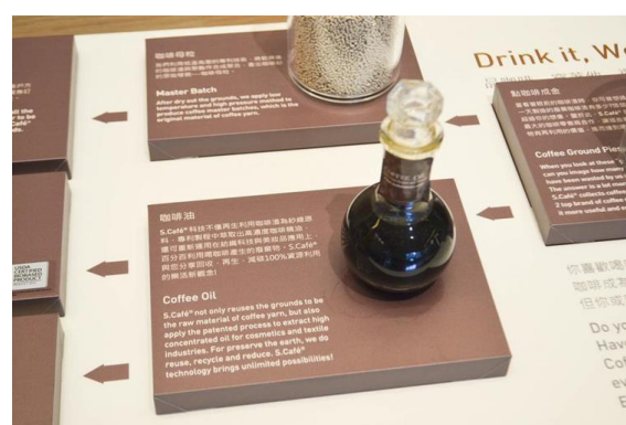
Figure 6: Coffee oil