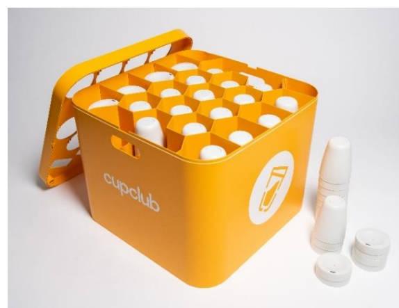
Figure 3: Cup Club cups