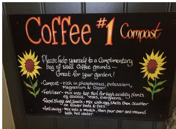
Figure 4: Coffee grounds for consumers