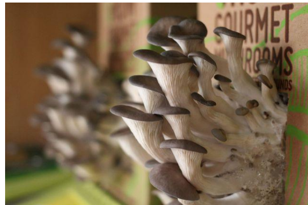
Figure 5: GroCycle mushroom growing box