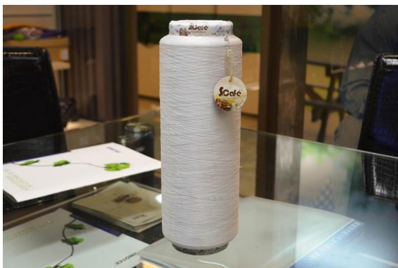
Figure 5: Coffee yarn

In Taiwan there has even been an organisation which has sought to make clothes and other products out of coffee grounds. Singtex has developed a process for turning coffee waste and plastic bottles into fabric. Roasted coffee grounds are mixed with polyester to create a coffee yarn. The company's clients include large brands such as Patagonia, North Face, Timberland, Adidas, American Eagle and Victoria's Secret (Wei, 2016). The company collects and uses around 500kg of coffee grounds a day. The company has also found use for other by-products from the coffee grounds: coffee oil is extracted from the leftover coffee and sold to cosmetic and soap companies.