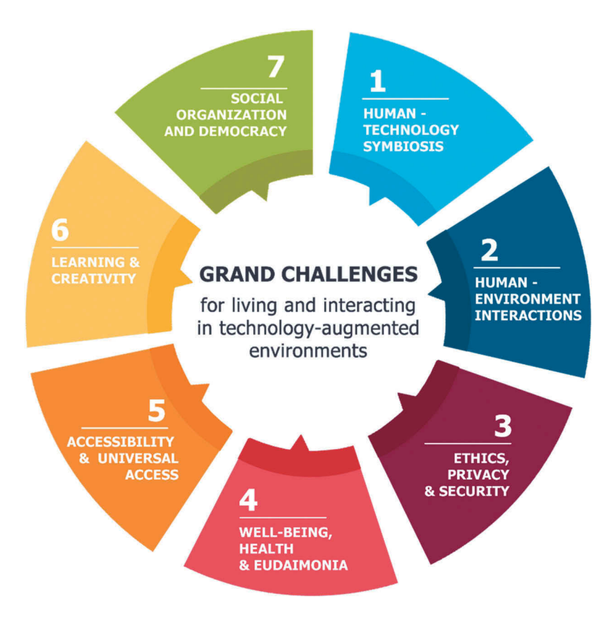
Figure 1. The Seven Grand Challenges.

The effort was motivated by the "intelligence" and the smart features that already exist in current technologies (e.g. smartphone applications monitoring activity and offering tips for a more active and healthy lifestyle, cookies recording web transactions in order to produce personalized experiences) and that can be embedded in future environments we will live in. Yet, the perspective adopted is profoundly human-centered, bringing to the foreground issues that should be further elaborated to achieve a human-centered approach – catering for meaningful human control, human safety and ethics – in support of humans' health and well-being, learning and creativity, as well as social organization and democracy.