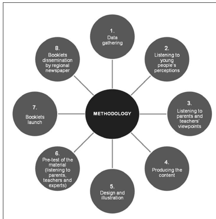
Figure 5. The project methodology.

In this project, media literacy was understood «in a context of empowerment and human rights» (Livingstone, 2011: 417), namely children's rights to participate, express their opinions and be informed, as advocated by the Convention on the Rights of Children. The core idea was to provide resources that empower citizens, young people and adults to deal critically with media, either traditional or new. As Livingstone stated, «it is certain that most cultures hope children will be critical media consumers, though not all provide, or can provide, the educational resources to enable this»