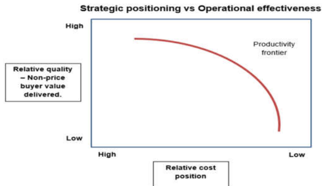
Figure 1. Strategic positioning vs operational effectiveness graph (adapted by Porter 1996)

efficiently. Although it has been argued that the two terms are different, Porter (1996) does still consider some importance of a strategy as he states, “a strategy is what gives an organisation a competitive advantage”.