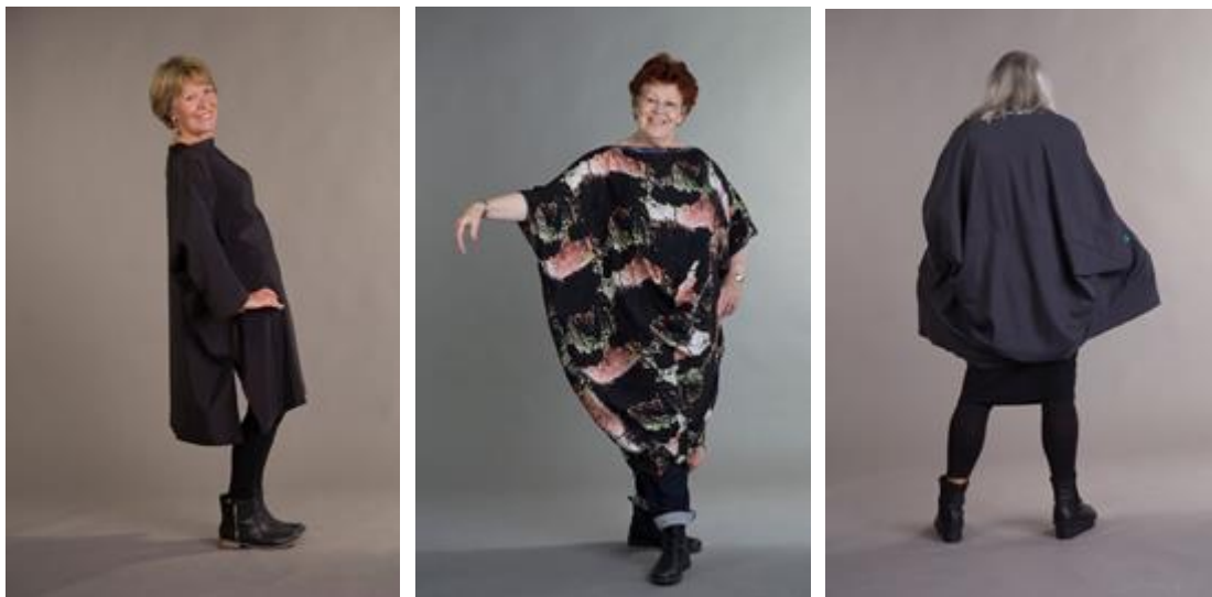
Figure 6. Rectangle Dress; Triangle Dress (Orchid) and Triangle Jacket

Phase 2 of the project culminated in the production of 30 garment prototypes (between June 2016 and April 2017) in contrasting textiles, including: Rectangle Dress 1, Triangle Dress, Jacket (fig. 6), coordinating tops, tunics and trousers in Small (8-12), Medium (12-16) and Ample (16-20). Rectangle Dress 2, Circle Top, and Circle Dress were produced in One-Size. The resulting garments were tested through a series of fittings, ‘trying on’ sessions and photo shoots with a professional photographer and finally modelled by 14 of the participants in a public dissemination event, held in April 2017, during Phase 3 of the project. The Emotional Fit salon was organised in association with Fashion Revolution Week to raise awareness of the older women’s support for sustainable design (fig.7).