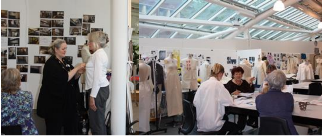
Figure 1a-b. Workshop 1: Taking body measurements; Small group discussion.

while establishing insights into individual aesthetic preferences, alongside technical details of existing clothing: silhouette, style, cut, length; colour, pattern, texture. The resulting qualitative data consisting of personal disclosures of attitudes, opinions and intentions towards fashion (Wilkinson, 2003) was supplemented with quantitative measurements.