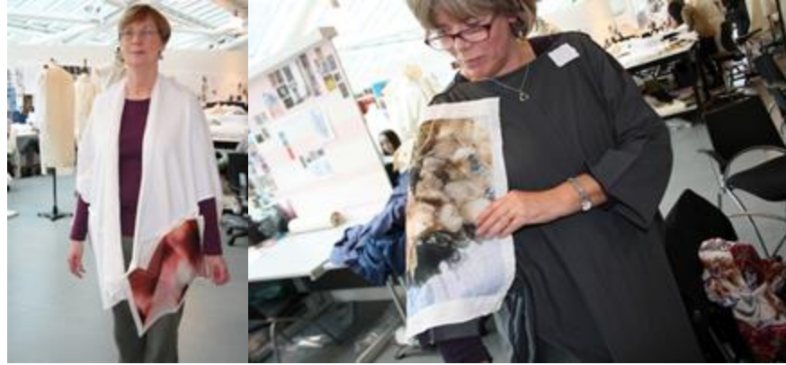
Figure 5. Workshop 4: Participants trying on the Triangle Jacket and Rectangle Dress toiles and selecting print designs.

Phase 2 of the project culminated in the production of 30 garment prototypes (between June 2016 and April 2017) in contrasting textiles, including: Rectangle Dress 1, Triangle Dress, Jacket (fig. 6), coordinating tops, tunics and trousers in Small (8-12), Medium (12-16) and Ample (16-20). Rectangle Dress 2, Circle Top, and Circle Dress were produced in One-Size. The resulting garments were tested through a series of fittings, ‘trying on’ sessions and photo shoots with a professional photographer and finally modelled by 14 of the participants in a public dissemination event, held in April 2017, during Phase 3 of the project. The Emotional Fit salon was organised in association with Fashion Revolution Week to raise awareness of the older women’s support for sustainable design (fig.7).