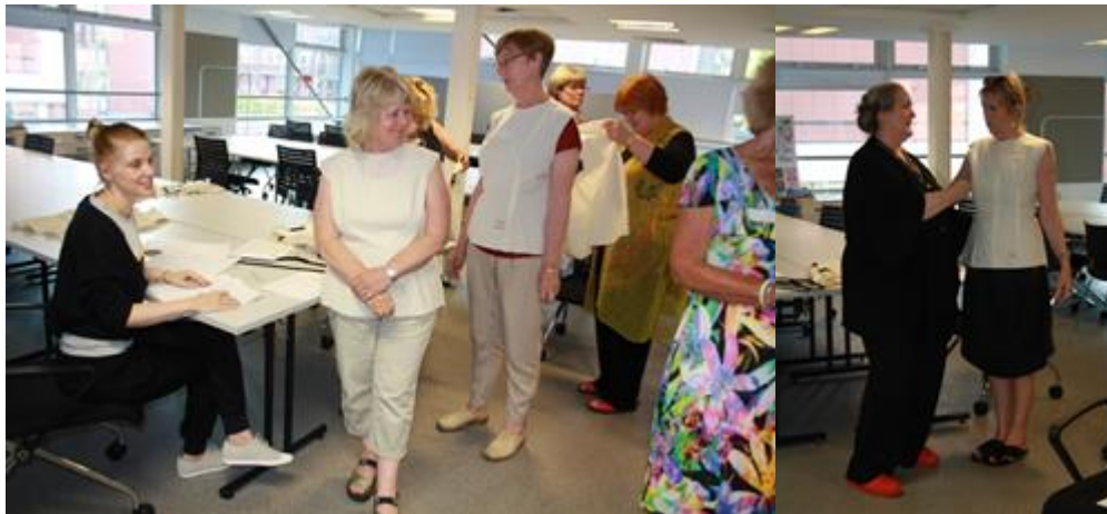
Figure 3. Workshop 2: the participants trying on the bespoke calico bodices, produced to their individual measurements and according to UK sizing charts (British Standards Institute, 2001).

Workshop 2 was conducted in June 2015 and was attended by 21 participants, who together with the researchers explored the exchange of ideas based on the group's "diffuse and expert knowledge" (Manzini 2015, p.37). Firstly, participants were introduced to the principles of geometric pattern cutting, an approach selected to accommodate multiple body shapes and preferences emerging from the study, while minimizing waste (Rissanen and McQuillan, 2015). Secondly, returning participants tried on the calico bodices (figure 3), constructed in relation to their body measurements (acquired in Workshop 1) cross-referenced with those from UK British Standard sizing charts (British Standard Institute, 2001). The development of 'live' blocks was the first stage of developing prototypes in line with the women's individual shape and style (Aldrich 2004, p.4). New participants were measured, their garments and preferences recorded to build on the data from Workshop 1.