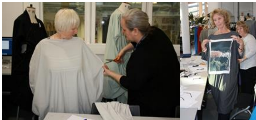
Figure 4. Workshop 3: A researcher adapting a toile; trying on toiles and selecting prints.

The second phase of research culminated in two co-designing workshops (3 and 4), which were similarly structured and conducted in March and April 2016. Following IPA’s commitment to idiographic, inductive and interrogative analysis the aim of the workshops was to elicit the ‘means’ of how fashion actors are engaged in particular forms of interaction, and the eventual ‘ends’ of experiential value that are co-created (Smith et al 2009). Consequently, participants worked collaboratively in each workshop with the researchers to develop a capsule collection, which effectively responded to the practical, emotional and ethical issues raised. This involved hands-on practical exercises, where toiles and printed textile swatches were tried on, manipulated and selected by the participants, facilitating the design development process (figs 4 and 5).