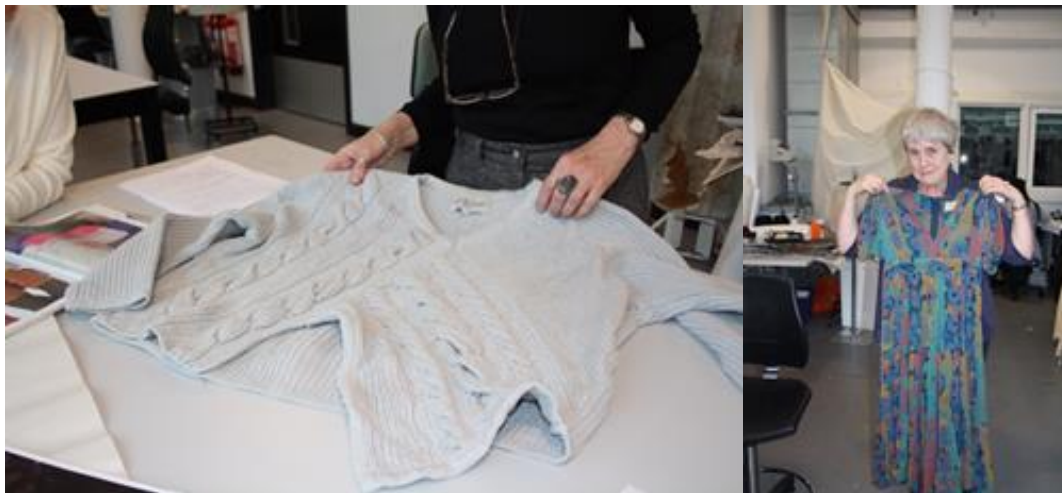
Figure 2a-b. Workshop 1: Recording a favorite garment; Show and tell.

In order to build on the qualitative data accrued in Workshop 1, a series of in-depth semi-structured interviews were undertaken with five participants in June and July 2015. Following the requirements of IPA, the selection process was based on the participants' suitability in terms of their