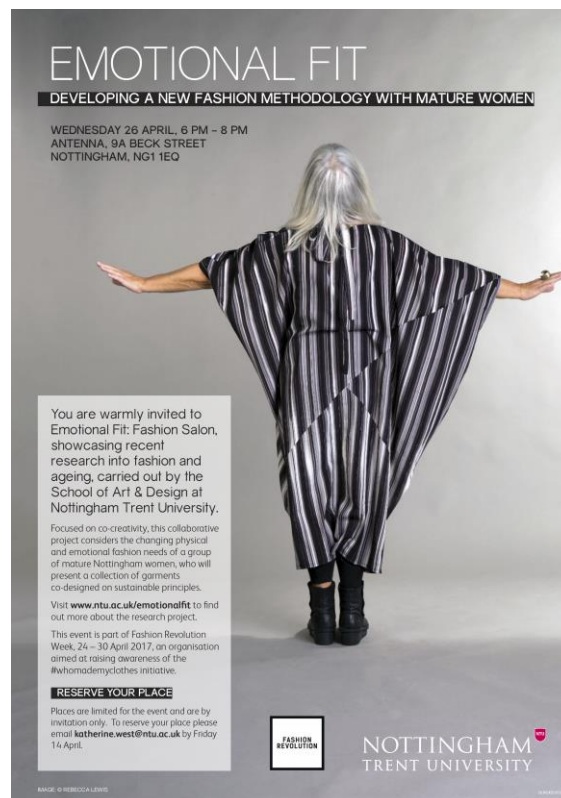
Figure 7. Triangle Dress (Stripe) on Emotional Fit: Fashion Salon advertisement

Workshops 3 and 4 were crucial in determining textile and shape selection for garment prototypes, produced to visualise, test and disseminate the research. The co-designing process involved potential customers mapping their design preferences into the material domain of a garment (Fiore et al. , 2001). Feedback on aesthetics found that while some prints were universal in their appeal, others were preferred as panels or linings to augment personalization in line with an “artisanal approach” (Aakko 2016). Generally, large-scale patterns were preferred over small repeats, pockets were essential and ties and drawstrings allowing for multiple styling options were popular. The key findings from Workshops 3 and 4 revolved around the importance of facilitating the conditions for empirical research by providing the opportunity for all stakeholders to explore their natural and professional designing capabilities (Manzini 2015, p.37). Participants attending the Phase 2 workshops reported that it was only through active engagement in co-designing that they felt their specific needs and expectations were being considered. Furthermore, they reflected on how being involved in the inclusive and transparent process of publicly modelling the garments enhanced their sense of ‘agency’ (Goode 2016), allowing them to develop a more positive attitude towards themselves and the concept of fashion (Niinimaki and Koskiken, 2011).