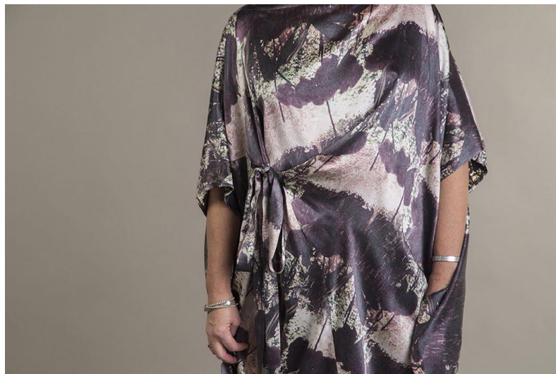
Figure 10. Close up of the kimono style Orchid print Triangle Dress showing it tied at the front and cut on the reverse of the original fabric in response to feedback from some of the participants.