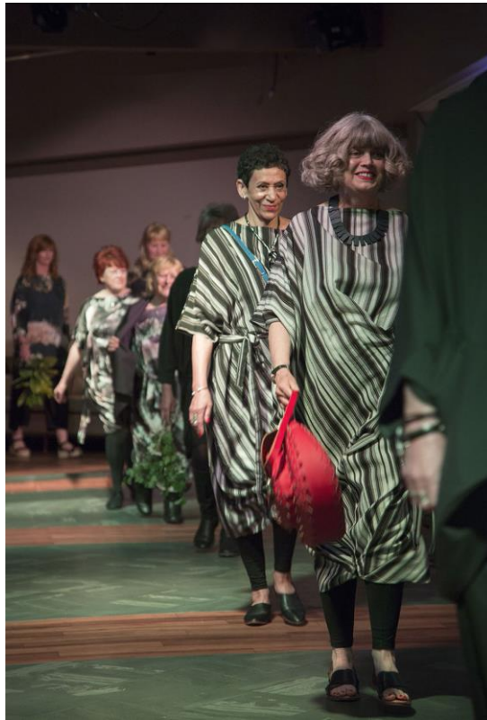
Figure 1. Photograph of the Emotional Fit Fashion Salon, a public event held at Antenna, Nottingham in April 2017, where participants modeled garment prototypes they had co-designed © Rebecca Lewis 2017.

settings. Section 4 provides a Discussion of the key points arising from focusing on the significant role of textiles within emotionally durable fashion design. Figure 1 features an image from the Emotional Fit (2017) fashion salon, where the co-created designs were modelled by the participants.