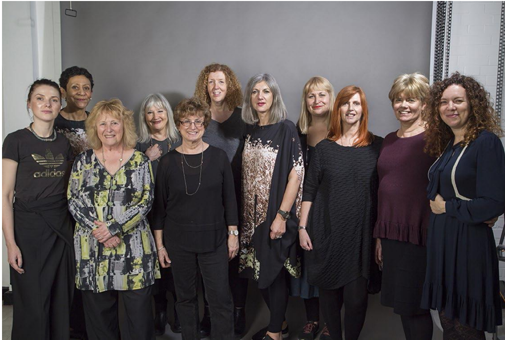
Figure 11. Some of the members of the Emotional Fit research team.