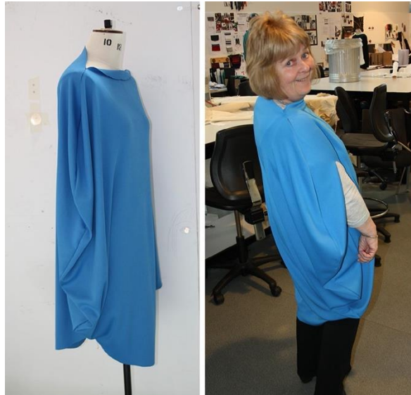
Figure 3. Geometric shape development with heavy jersey to produce a circular toile on the stand and body form.