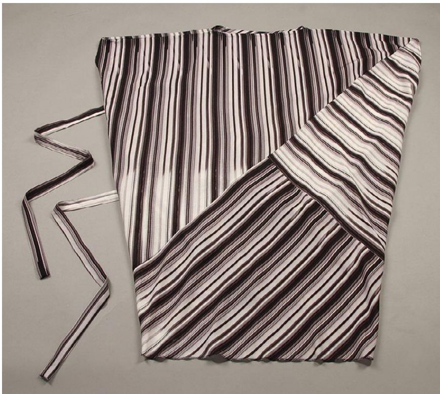
Figure 7. 2D version of the Medium Striped Triangle Dress showing configuration of pattern within the garment shape.

The Stripe print was manipulated to visually contour both the garment and underlying form of the wearer by repeating and stretching the vertical elements across the total (145 cm) width of the fabric, at three varying scales and tones; generating three contrasting iterations from narrower and lighter to wider and tonally darker. The digital crafting approach resulted in each garment having a unique visual effect on the body, achieved by the team considering the aesthetic and physical attributes of print, garment and body simultaneously (Townsend 2011: 288). The Stripe design was also mediated through a strategic cutting approach. Although zero and minimal waste were prioritised, the geometric shaped pieces of the Triangle Dress, allowed for varying arrangements to be explored through the construction process, while adhering to the straight-of-grain. The dual aim of sustainable cloth consumption while creating a garment with a bespoke aesthetic, was facilitated via a combination of jigsaw lay planning, optical prints, patch-working and trompe l'oeil pleat effects (Townsend and Goulding 2011). Figures 7 and 8 show different print configurations on two dress fronts. This hand/digital method also draws on Piper's Composite Garment Weaving method where the consideration of 2D "functional" textile production aspects strongly inform the "design aesthetic" of the final 3D object (Piper and Townsend 2015: 18).