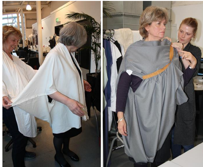
Figure 2. Initial experiments using live draping using jersey and woven qualities and the whole width of the cloth.

and patterned, or how people wrap their bodies as part of their wearing behaviours. (Jeon 2015: 149)