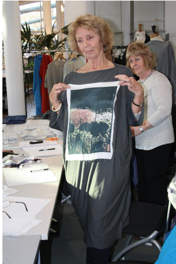
Figure 6. One of the research participants trying on a toile and selecting a complementary printed textile.

The reintroduction of the body into the fashion process was reciprocated via personalization through folding, stretching and cutting to reduce or extend the silhouette and prints being compared, and animated to mimic and assess drape and performance. Here, the “body itself became an essential structure in crafting the form of the textile design” (Jeon 2015: 138). It was the participants “sensing” of the research materials using their “embodied fashion knowledge” that most significantly influenced the development of the prototypes. The approach unified meanings associated with the different kinds of materiality (and immateriality) inherent in “objects of fashion”, clothing items kept as “treasured possessions” and “virtual” representations of fashion – “which are consumed as part of the process of identity formation through fashion” (Woodward and Fisher 2014: 9).