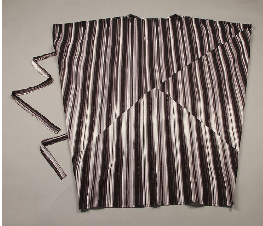
Figure 8. 2D version of the Ample Striped Triangle Dress showing different configuration and tonal range of pattern than the Medium version (shown in Figure 7).

The Triangle Dress was also fabricated in Orchid printed silk, which was scaled according to the three grouped sizes and cut on the more subtle, reverse of the cloth following feedback from the participants. While both the Stripe and Orchid versions of the dress presented distinct visual and material aesthetics, each incorporated “empathic design” features, such as long ties, pockets, reversibility (both the textile and garment could be worn back to front) allowing for multiple styling options to enhance textile and “product attachment” (Niinimäki and Koskinen 2011). Figures 9 and 10 illustrate the divergent material aesthetics achieved through similar silhouettes.