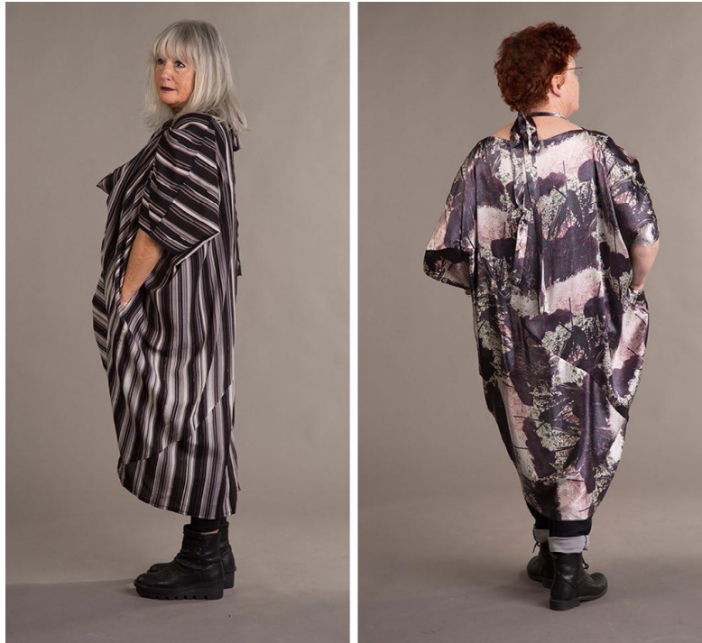
Figure 9. Striped and Orchid Triangle Dresses modelled and styled individually by two of the research participants.