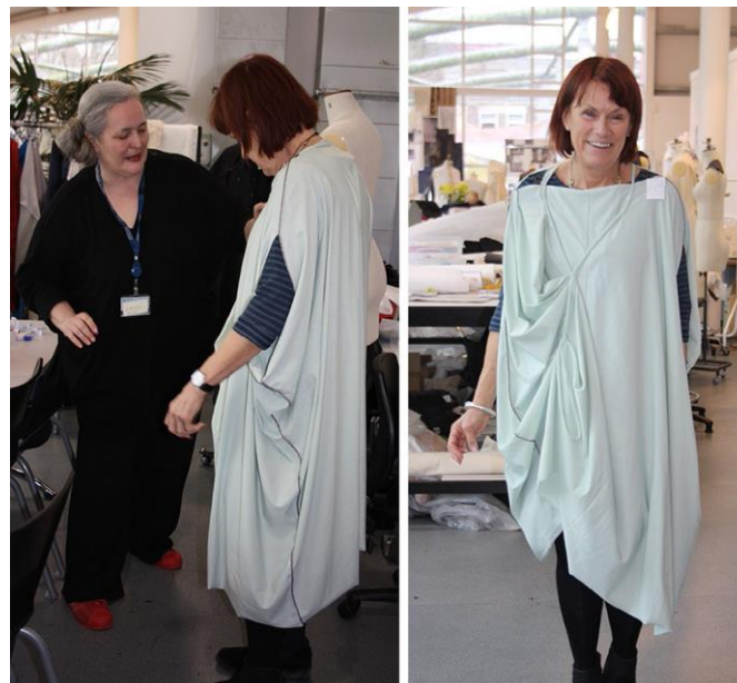
Figure 4. Modeling lightweight jersey on one of the research participants to produce a manipulated, rectangular toile.

Adopting geometric pattern cutting offered possibilities for creating minimal, versatile silhouettes with a similar aesthetic to traditional garments such as the sari, kaftan and kimono, reinforcing references made by the interviewees. These universally worn and recognized shapes also facilitated multiple patterning and flexible styling options in line with the “artisanal” or “in-between” fashion (Aakko 2016) produced by independent, craft based designers.