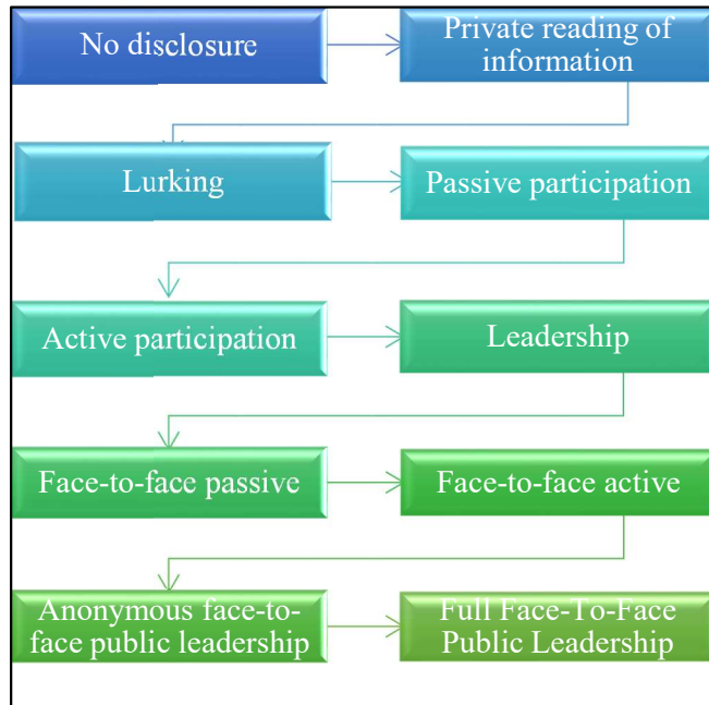
Figure 2. The Pathways Disclosure Model.

to a full face-to-face disclosure of events for the purpose of help seeking. This model is outlined in figure 2.