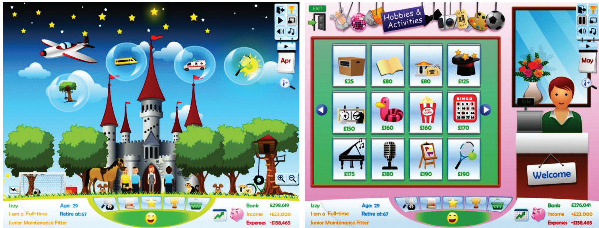
Figure 1. Game screenshots showing a player's accumulated family and housing (left), and an in-game store with options purchased from the player's salary (right)

Career videos were embedded within the game as shown in Figure 2. As players progressively viewed a video, they unlocked skills for their character, useful when seeking to enroll in courses for further and higher education, or to apply for jobs. Elements such as transferability of these skills was emphasized through their use for multiple courses of study or jobs, seeking to allow players to gain an understanding of how skills may be taken in a broader context and used for a variety of career