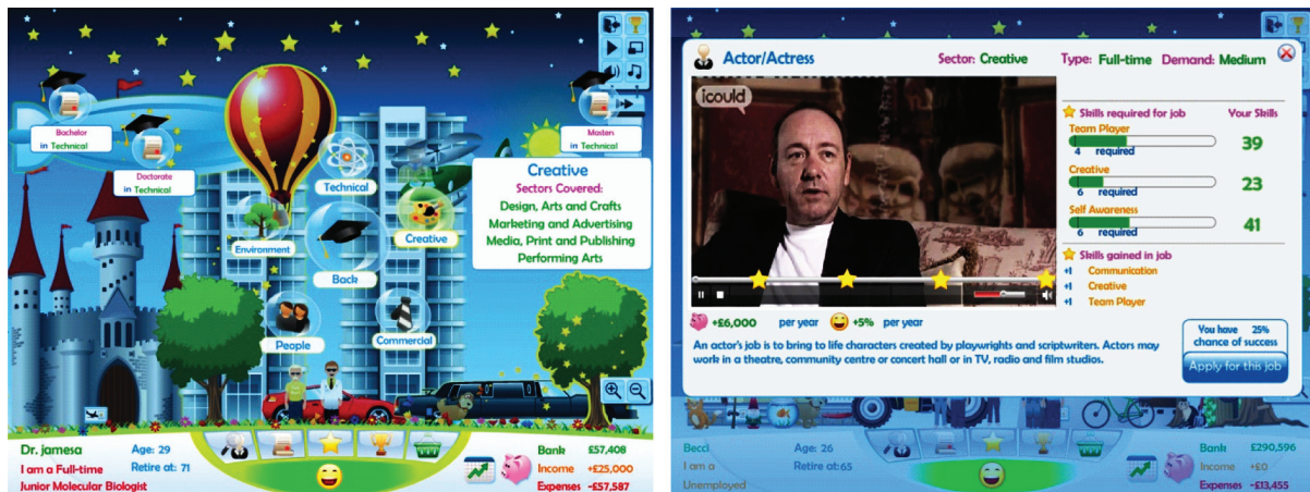
Figure 2. Images from the game showing the various sectors included (left), and a viewing of an informational video from an expert in a given profession (right)

paths and options. Figure 2 also shows the various sectors, grouped into technical, creative, environment, people, and commercial professions. This reflected the diverse nature of the careers videos within the game, and the desire to support as wide a range of potential professions as possible to reflect the diverse audience for the game. The game also introduced events at points during a players lifetime, to represent the unpredictability of the events they might face, and allow them to