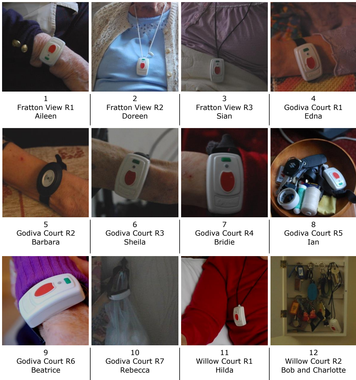
Figure 2: Residents and pendants at time of visit

was concerned to address it by raising the need to wear the pendant whenever he saw Ian, including provide reassurance on 'false alarms'.