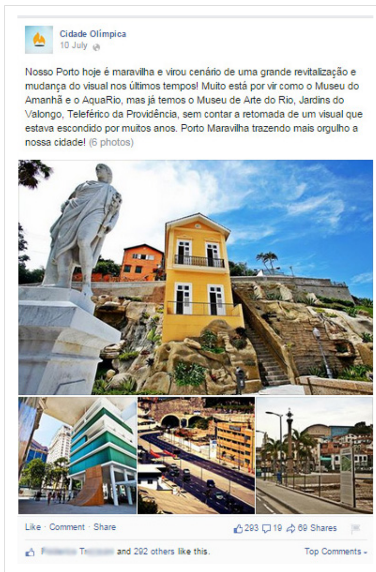
Figure 3: Post on Porto Maravilha recreational area developed in the city

should be a way to promote integration. The lack of discussion of these issues on the page, which has the stated and overt aim of disseminating the legacy of Rio 2016, is a poor reflection of the attitude towards raising awareness of disabled communities as a legacy of the 2016 Games.