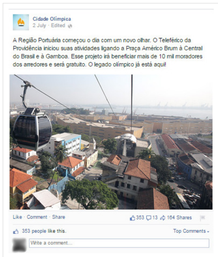
Figure 2: Post on free cable car installed in the Providencia community

The analysis of 'Cidade Olímpica' on Facebook showed no attempt by the Brazilian government to highlight issues relating to disabled people and disability. From the total of 33 analysed posts, there was only one that referenced the issue and, tellingly, this reference was linked directly to the Paralympic Games. There was no reference to the legacy that projects will provide for citizens who have a disability. When it comes to the "Sport-For-Development" discourse, it was restricted to the construction of narratives that exalted great architectural infrastructure, mobility and leisure whilst failing to address issues of equality and access.