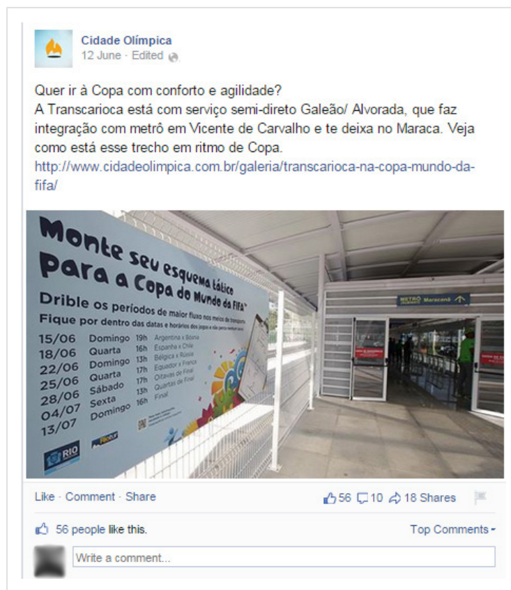
Figure 1: Post on transportation service during match days in Maracanã

Other posts on mobility were identified; one of them was specifically about a free cable car that was installed in a community called Providencia (Figure 2). According to information from the page itself, at least 10,000 people would benefit from this rapid transit service. But, once again, there was no information on accessibility for disabled people on this service.