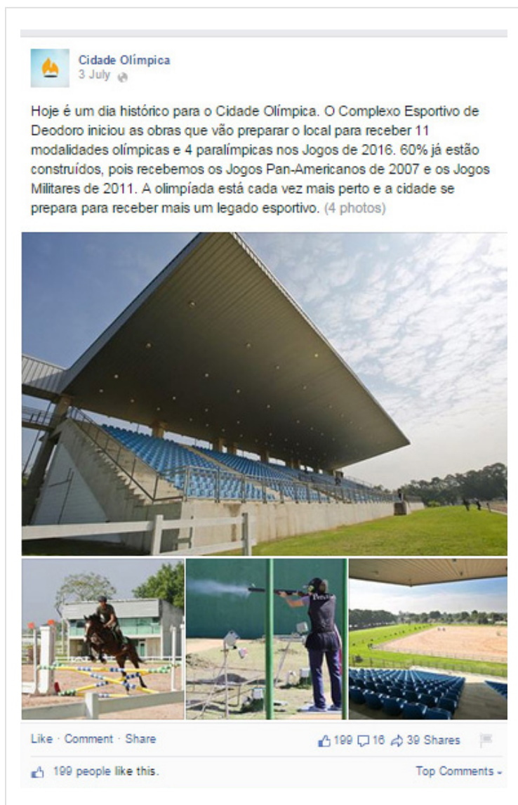
Figure 4: Post on the infrastructure of Deodoro Sport Complex

referral program with two objectives in mind: to extract immediate revenue and to advertise to potential customers.