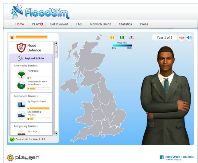
Figure 1 FloodSim's interface

FloodSim is a simulation developed by PlayGen Ltd 1 and commissioned by Norwich Union 2 . The objectives of the simulation are: to 'help raise awareness of the flooding issue surrounding flood policy and Government expenditure and to increase citizen engagement through an accessible simulation'. FloodSim allows the player to take on the role of flood policy strategist employed to implement a selection of strategies for addressing the risk of flooding over the course of 3 years based on a pre-defined budget, see Figure 1. A brief comment on the advantages and drawbacks of each option is presented when the mouse is rolled over each icon. The player selects each strategy by dragging the icon over a region of the UK.