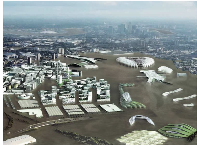
Figure 4 A simulation of floods in London's Olympic site

To throw some light onto FloodSim's societal impact in raising awareness about flood policies and citizen engagement, the data collected during the first 4 weeks was analyzed. These analyses were undertaken during November 2008. The purpose of these analyses was to assess the extent FloodSim raised awareness of the risk of flooding and what players thought could be done in terms of flood prevention.