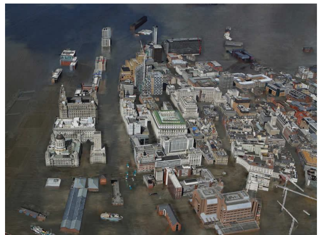
Figure 5 A simulation of floods in Liverpool