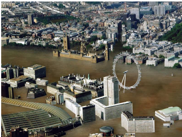
Figure 3 A simulation of floods in London's Westminster

At the end of the simulation, players are asked their demographic information (location, age range, and gender) and are invited to answer a few questions regarding their experience with FloodSim, and may leave general comments which require an email address. The feedback section was organized in 5 areas for the player to comment on relating to issues to Flood Policy. FloodSim was released in 2008 following the devastating floods that were experienced in the UK in 2007. It was advertised through various websites and magazines, and could be accessed freely from PlayGen's website.