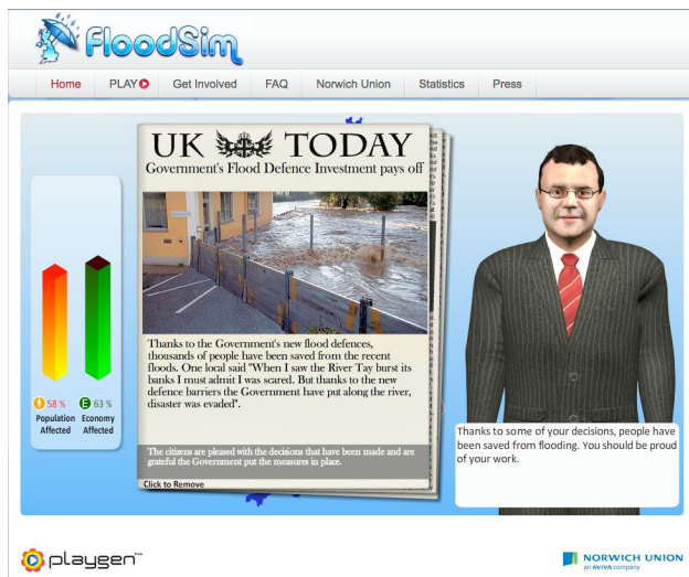
Figure 2 Feedback provided by FloodSim

Level of Protection, Current Population, Flood Risk. If strategies are not well considered the consequences could be flooding of cities, such as London (Figures 3 and 4) or Liverpool (Figure 5).