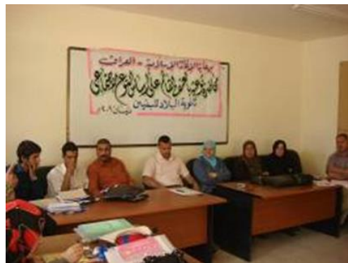
Figure 4: GBV prevention workshop for school teachers.

Broader social issues which were seen as contributing to GBV were the lack of employment opportunities within Iraqi society. It was strongly felt that finding effective measures to reduce joblessness would have a genuine secondary effect on violence in society in its broader sense and impact positively on behaviour towards women and girls.