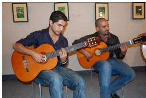
Figure 6: Artists performing at a GBV prevention workshop.

Two further musical sessions were held with the participation of eight musicians who were students in the music department of Baghdad University and now also trained facilitators on GBV and VAWG from the earlier workshop. They presented musical compilations and