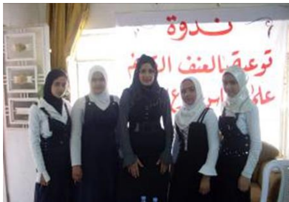
Figure 3: Trained young women beneficiaries at a GBV workshop.

Through responding to the questionnaires, which were distributed at the end of each session, participants were able to present a number of recommendations for improving gender justice in conflict/post-conflict Iraq. The key practical suggestions came from workshop delegates employed in the education sector across primary, secondary and tertiary levels, who expressed a willingness to hold awareness sessions on GBV and VAWG in schools, colleges and universities across the city for peer groups and students. Furthermore, they were keen to explore the employment of psychological professionals into the education sector, dedicated to guiding employees and students in schools and colleges. More qualitative recommendations focused on the importance of a return to the religious values enshrined in Islamic law, which participants felt was lacking within communities, in terms of moral and ethical values in human interaction and relationships.