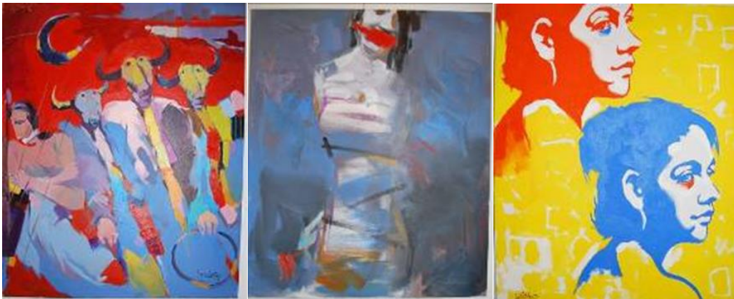
Figure 8: Winning pieces (first, second and third places from left to right).

IR also supported each artist with the necessary painting equipment required to produce their work and a committee was formed to reward the participants with certificates of appreciation and gifts and select three winning paintings to receive pecuniary awards at the closing ceremony (Figure 8).