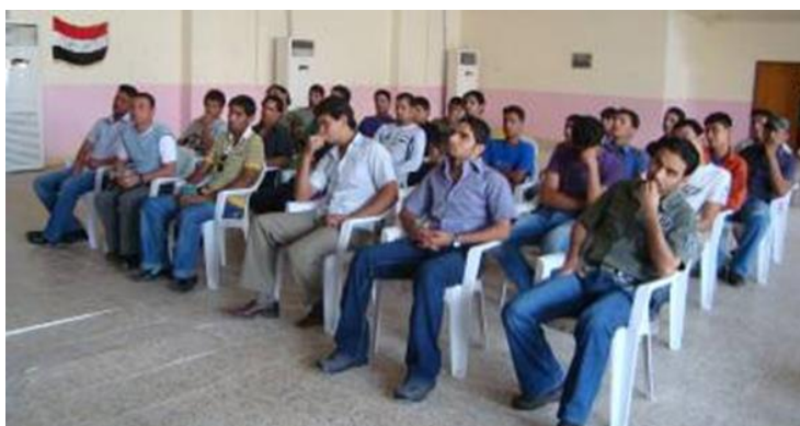
Figure 1: Beneficiaries of one of the sessions.

Beneficiaries of the workshops included all male groups, with educational level ranging from secondary school students to university graduates (Figure 1); one all-male teenage group in the age range 12-17 years old; another aged 14-21; and another all male group made up of adult athletes. Female groups were composed of housewives (Figure 2), secondary school students and college and university students (Figure 3). The remaining groups were mixed gender adults of varying educational and social backgrounds, including one mixed gender teaching staff of a school (Figure 4). The workshops were conducted in areas of Baghdad of varying affluence and social class, including Al-Husseinia, Rusafa, Al-Taji and Al-Sha'ab districts.