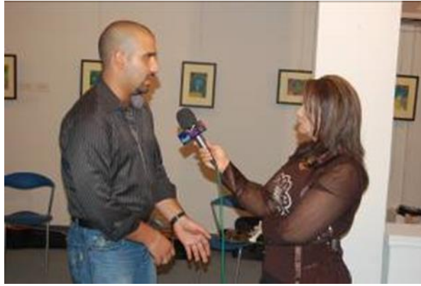
Figure 9: One of the artists speaking to a media TV channel about his performance and its relevance to GBV prevention.

The Islamic calligraphy exhibition focused on gender justice in Islam and included depictions of Qur’anic scripture, sayings of the Prophet Muhammad and other proverbs from Arabic tradition, alluding to the fair treatment of women in society (Figure 10).