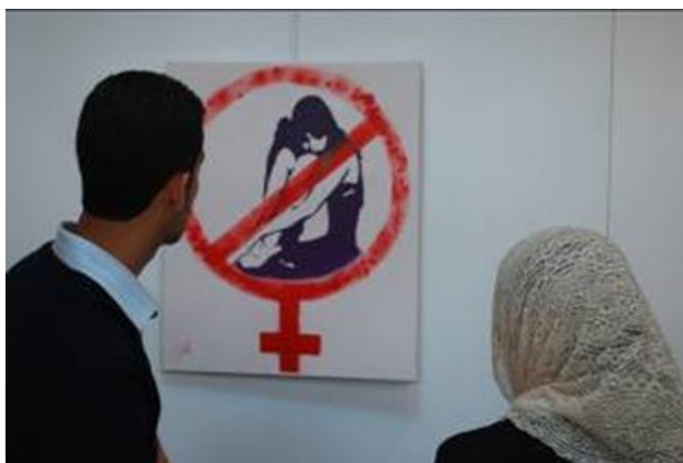
Figure 11: Visitors to the exhibition viewing a piece on sexual exploitation.

Artistic expression depicted ‘the woman’ both in reality and symbolically, alluding to how violence is often characterised in both concepts; reality in terms of displaying the human body as a tool to express violent emotions and expressing the reality of violence in the society (Figure 11); and symbolically as seen through distorted cultural and traditional values, using iconic symbolism to communicate fear, forbidding and danger.