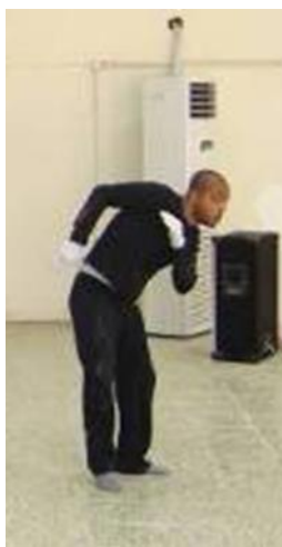
Figure 5: Trained facilitator and mime artist performing at a GBV workshop.

Role playing through drama exercises involved creating participant groups who were asked to perform representations of violence against woman. The exercise was introduced through a demonstration by a facilitator who was a trained mime artist (Figure 5). The musical workshops presented pieces of music, which included messages calling for peace and preventing VAWG (Figure 6). The band, called Al-Nhrain, performed five pieces of music from Iraqi tradition, representing: the loving relationships between the Iraqi people ('Habayeb', from the artist Rawhi Khammash); a song expressing the experiences of Iraqi children living under occupation ('Remember' by Khadum Al-Saher); a traditional piece created by the artist for his wife as a message of love and respect ('Umm Sa'ad' by Muneer Basheer); an original piece, 'Remains of Hope', created by band member Bilal, representing his personal lived experience of violence; and a final piece ('Flying Bird' by Jameel Basheer), which speaks of freedom. The band concluded by dedicating their performances to the prevention of violence in all its forms and a call for peace, unity and solidarity among the people of Iraq.