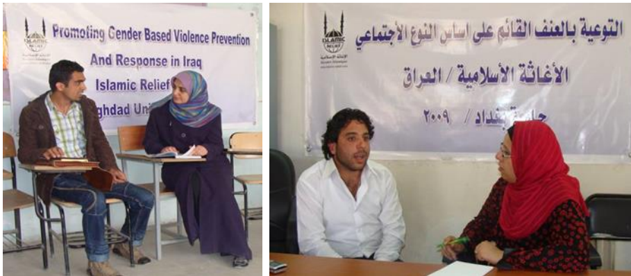
Figure 12: IR Project Managers discussing GBV prevention with male participants.

At the national level, this programme identified that engagement with wider post-conflict Iraqi society is essential. Advocacy is a critical component in raising awareness across society and can help remove iniquity and injustice through empowering women to access their rights, as well as promoting that the responsibility for gender justice falls to all society, including men (Figure 12).