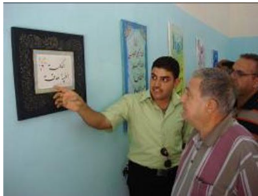
Figure 10: One of the artists introducing his calligraphy to a departmental head at the university.

The Islamic calligraphy exhibition focused on gender justice in Islam and included depictions of Qur’anic scripture, sayings of the Prophet Muhammad and other proverbs from Arabic tradition, alluding to the fair treatment of women in society (Figure 10).