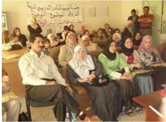
Figure 2: Facilitator (front left) with the GBV prevention workshop attendees.