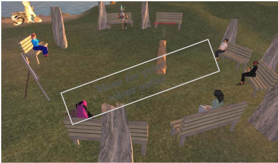
Figure 1. The meeting space in SL.