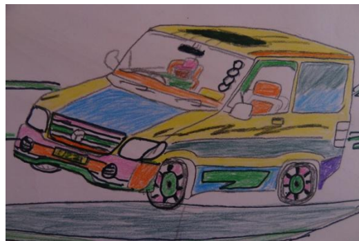
Examples of drawings produced by two children with albinism at Salima School for the Visually Impaired