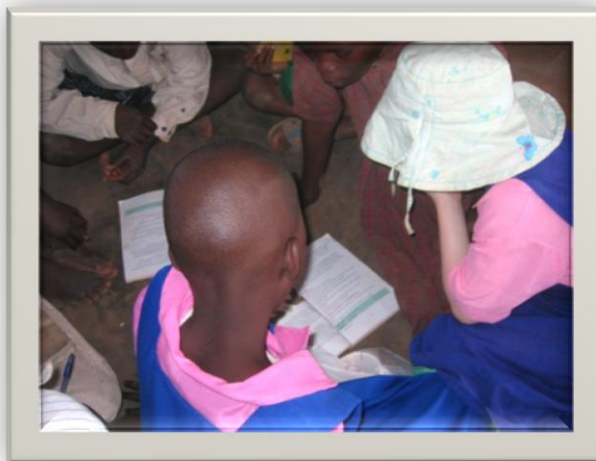
Young girl with albinism sharing a textbook with two other children in a Primary School in Blantyre Rural

'When reading a book, I don't have a personal book so we share in a group of 6 or sometimes 7; I have no chance to hold the book so I struggle to see properly. As a result I just sit in the group. I would prefer if I was holding the book.'