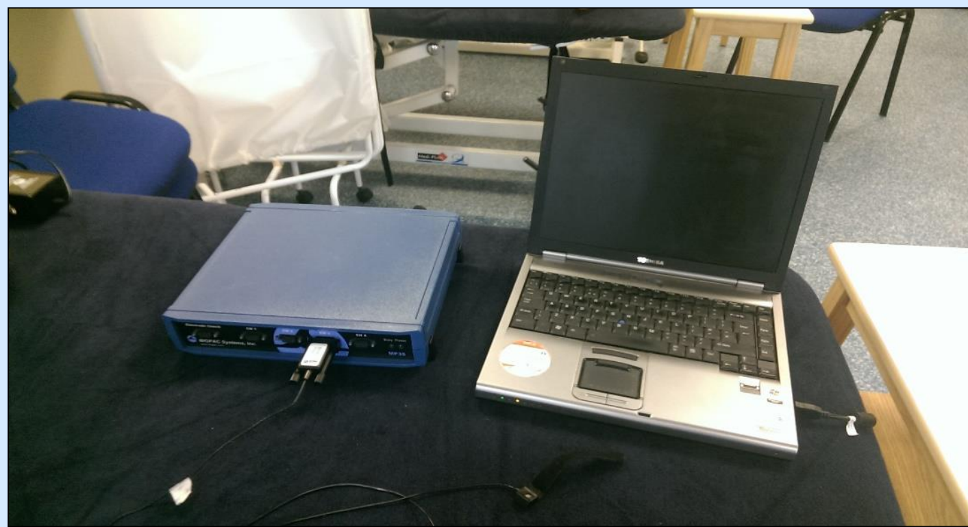
Figure 1: Biopac GSR100B Electro-dermal Activity Amplifier