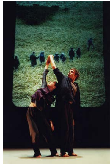
Lee's Passage (2001, photographs by Pau Ros)