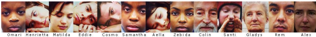
Images from the Passage website (2002), photographs by Pau Ros and Rosemary Lee

My own research refers to Lee's practice only if she has given prior feedback and permission to publish (as is the case with the present discussion). This section centres on her feedback on a description I made about observing aspects of the making of Passage . Lee's feedback stands here as caution to academic interest in choreographic practice: