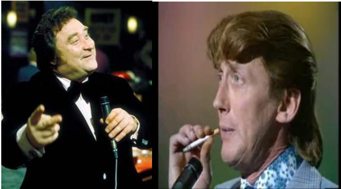
Figure 2 (right) Colin Crompton on The Comedians