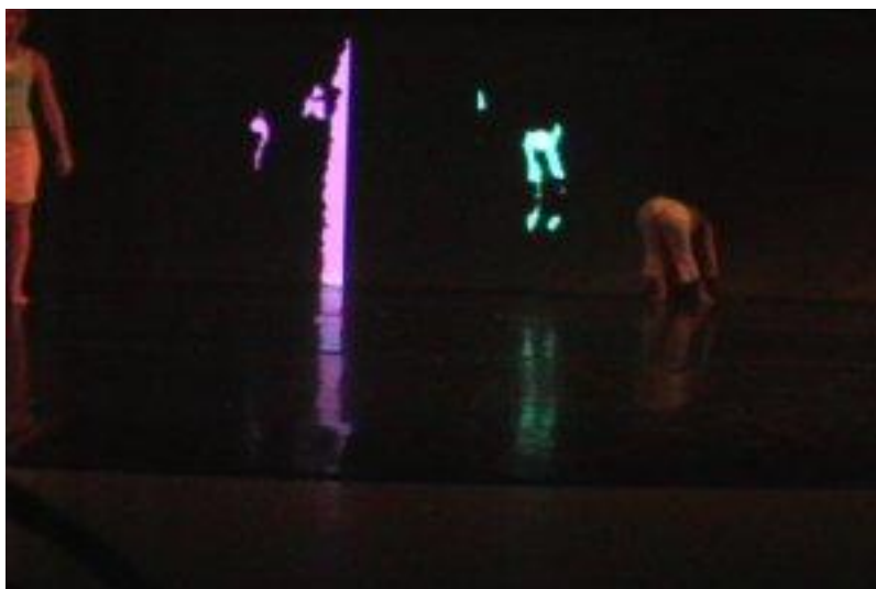
Figure 3 – Performer out of the frame of the camera and lighting disrupting projection (video still)

In addition to the issues in the performance with the physical space, the performers' relationship to the camera space contained many problematic elements. Within the author's previous work, the creator and the performer were the same, therefore an awareness of the camera placement and camera space was understood, such as the limits in the physical space where the performer can dance and be seen by the camera. Being seen by the camera in turn produces the visuals within the projection space. Although there was a full week of rehearsals with the camera system, the rehearsals were never in the actual performance space, which changes the limitations of the physical space, the placement of the camera, and what the camera space is.