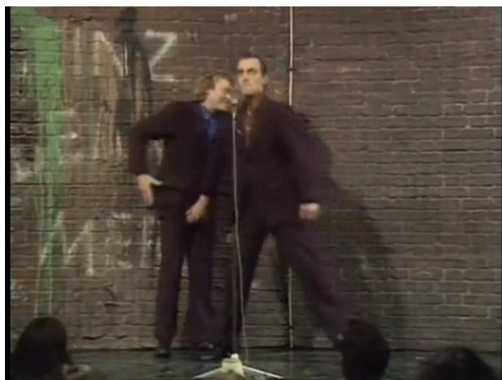
Figure 5 The Dangerous Brothers circa 1981

I have chosen Mayall and Edmondson's knockabout double act The Dangerous Brothers (Figs. 5 and 6) as the second exemplar because they are atypical of the popular memory of alt-com as an aggressively political form of comedy-cabaret. Nonetheless, the Brothers' routines appropriated the punk characteristics of rudeness, frequent swearing, anger and confrontational physicality. This attitude makes them the negation of spectacular double acts like Cannon and Ball and Little and Large. The traditional dynamic of such double acts rests is supplied by the tension between the