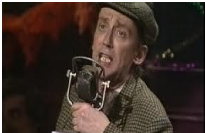
Figure 1 Colin Crompton, The Wheeltappers and Shunters Social Club

A revealing feature of social club comedy was the presentational style of the performer. This applies to the choice of stage wear as well as the often aloof-but-amiable ‘bloke-in-the pub’ persona, whose delivery of the jokes resembles that of the production line; all of jokes formed in the same fashion: set up, gag and punchline. In the social clubs, the comedian would dress in a suit, often with a bow tie and frilly shirt. This is a sartorial device that is intended to lend the performer a slight air of superiority; it is indicative of the power relationship between the comic and the audience. The suited comedian stands before the audience as a figure of humorous authority yet, at the same time, he appears as their best friend. However his sartorial choice distinguishes him from the common man in the audience, whose best clothes probably consist of a ‘demob’ suit or something ‘off-the-peg’ from Burtons.