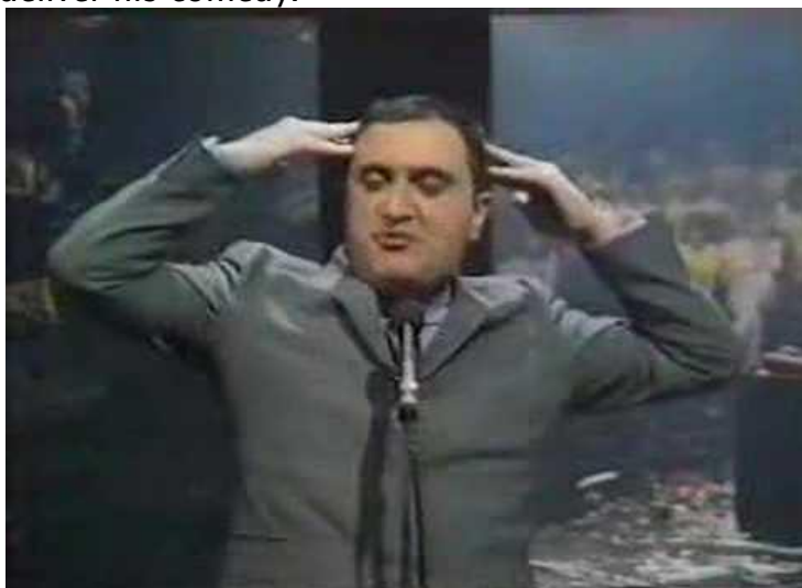
Figure 3 Alexei Sayle on OTT, January 1981

The first wave of acts came from left-wing political theatre or had been punks or had been actively involved in left-wing political parties (Ritchie, 1997). For example, Alexei Sayle’s parents had been members of the Communist Party of Great Britain (CPGB) (Cook, 2001). His art school education 19 and the political capital that he had acquired from the CPGB had given him a different set of tools with which to shape his comedy. By contrast, Manning had come from a petit-bourgeois background (his father was a greengrocer) and he had begun his career as a singer with a big band. Sayle had worked in political street theatre, where physical skills were employed as a matter of course. In his appearance in the first episode of OTT in 1981, we see how Sayle used his physicality to deliver his comedy.