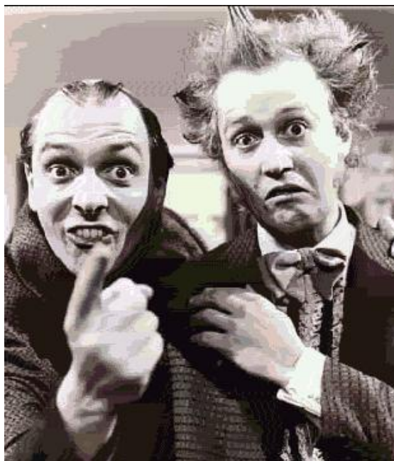
Figure 4 The Dangerous Brothers circa 1982

could make a subcultural connection to his audience, who were often of the same age and social demographic. It is worth mentioning that 2-Tone, of which The Specials and bands like Madness and The Selector were a part, was a sonic fusion of Jamaican ska and punk. Their sartorial style was derived from the earlier West Indian rude boy and mod styles of the 1960's. The attitude and socio-political consciousness of bands like The Specials came directly from the same lived experiences that were often expressed in punk songs: alienation, unemployment, urban decay and so forth.