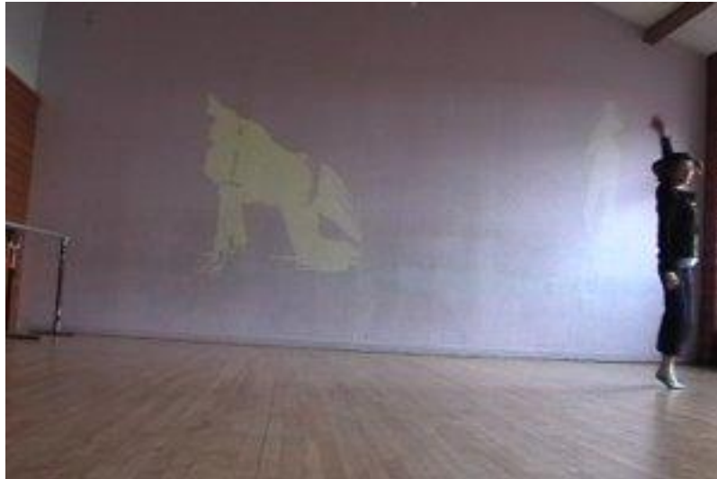
Figure 2 – Choreographer with triptych projections (video still)