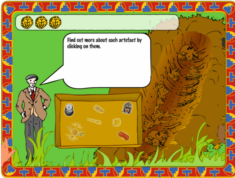
Fig. 1. Excavated artefacts in ordinary mode

Figure 2 shows the excavated artefacts in the serialist mode, here the user is presented with a next button which guides the user through the videos and activities in a set sequence designed to scaffold the acquisition of knowledge and understanding.