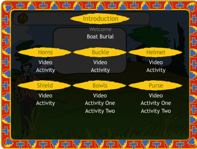
Fig. 3. Holist mode index screen

Finally, in the holist mode the user is presented with an index screen (as shown in Fig. 3) before uncovering the artefacts, this provides the user with an overview of all content. This enables the user to choose the sequence in which they wish to navigate through the product.