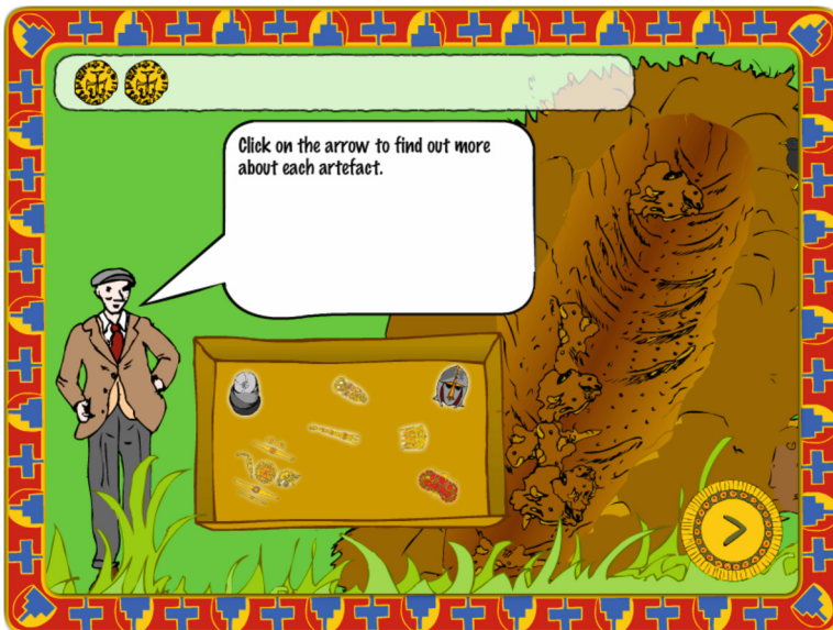
Fig. 2. Excavated artefacts in serialist mode

Figure 2 shows the excavated artefacts in the serialist mode, here the user is presented with a next button which guides the user through the videos and activities in a set sequence designed to scaffold the acquisition of knowledge and understanding.