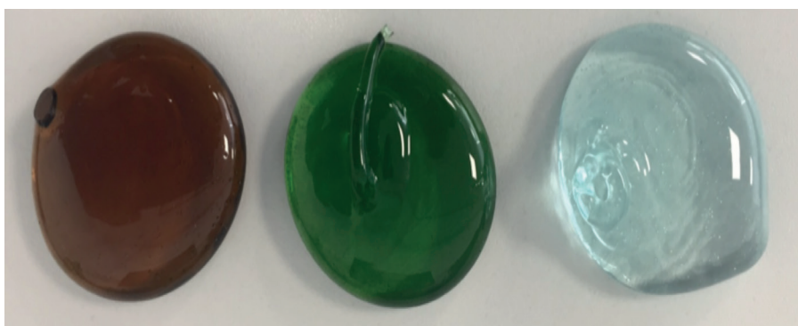
▲ Fig 2 Laboratory-manufactured amber, green and colourless glass samples produced from reformulated commercial container glass batches with biomass ash.

of local materials. In the Levant and Near East, ashes from halophytic plants from the Salicornia and Salsola genera were used, whereas in northern Europe wood ashes were used, primarily beech ( Fagus ) ash. These wood ash glasses are known as 'Waldglas', ('Forest Glass'). Wood ash glasses were found in the Carolingian Empire from as early as 800 A.D, and their industrial manufacture continued into the 18th Century.