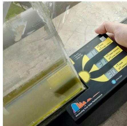
Figure 1. Readings taken using solar spectrum meter

Material needed to construct the basic flat panel PBRs for this experiment were acrylic panels, yeast, sea water, plastic tubes, and water bottles. In order to monitor the experiment, a solar transmission and power meter model SP2065 (to determine solar radiation) as well as a solar spectrum meter SS2450 to determine daylight transmission level (as shown in Figure 1) were used.