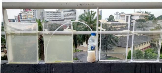
Figure 2. From the right is Panel A, Panel B, Panel D and Panel C