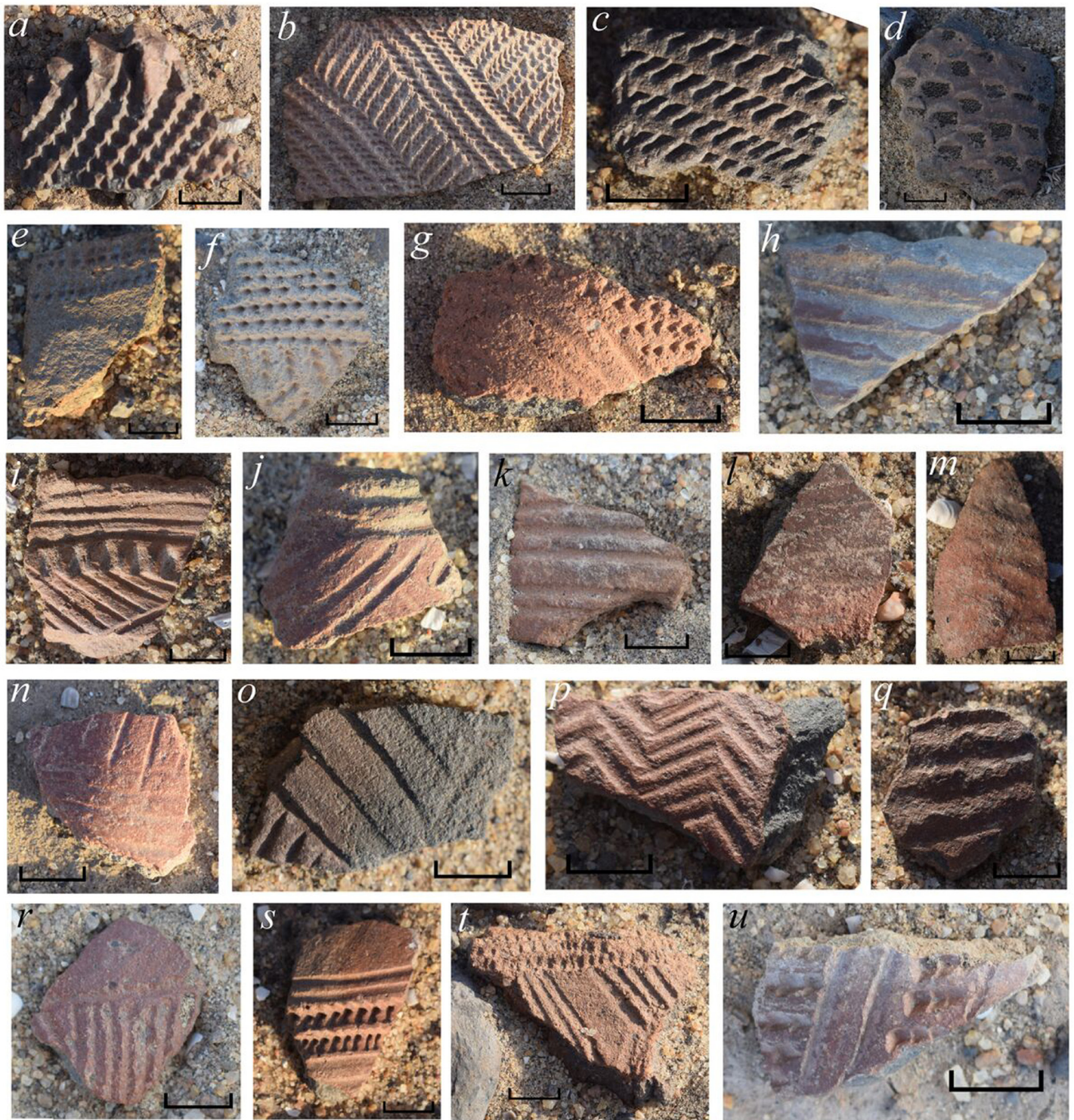
Figure 4: Examples of the range of pottery decoration types on the stone platform of Aliel. a Nderit ware rim sherds everted; b-d Nderit ware body sherds showing evidence of different stylus types; e Kansyore-like ware plain rim sherd; f-g Kansyore-like ware body sherds; h-j rim sherds of grooved decoration (i-j with flaring lip); k-l grooved decoration body sherds; m ripple decoration body sherd; n-o body sherds with zoned groove decoration; p grooved chevron decoration; q non-uniform grooved decoration; r-u multi-pattern grooved and stamped body sherds. Scale is 1cm.