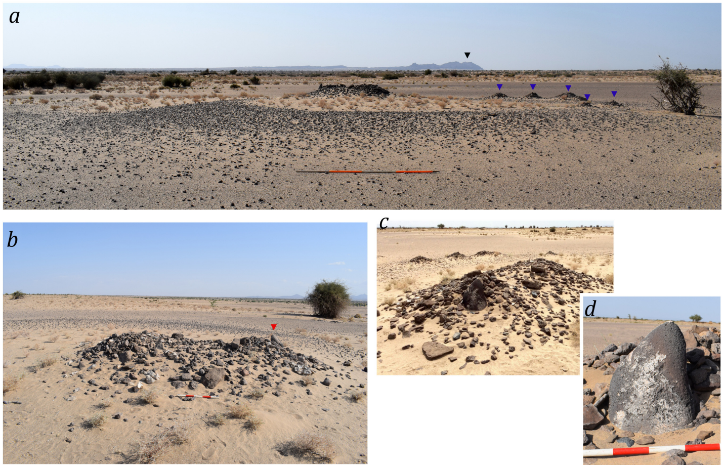
Figure 2: a. View of the southeastern face of the stone platform with large central cairn and five smaller cairns (blue triangles) – Lothagam Ridge, the site of well-known Pillar sites, can be seen on the horizon (black triangle); c. the large central cairn – the standing stone or pillar can be seen on the right of the cairn (red triangle); d. a frontal view of standing stone at the head of the cairn; e. the standing stone.

5005-4980, Beta-447866) using bulk organics from a single sherd of Nderit ware found on the surface of the platform. Chronologically, this places Aliel in the earliest phase of construction of the oldest ‘Pillar sites’ of Turkana, Lothagam North and Jarigole, currently dated to 5033-4870 Cal BP and 5270-4857/5212-4853 Cal BP respectively (Grillo & Hildebrand 2013). It also supports the view held amongst the local Turkana population, that the monument is not recent. Widespread oral traditions describe Aliel as the resting place of an ancient and powerful mganga -- witch doctor-- that lived in the area prior to the arrival of the Turkana people.