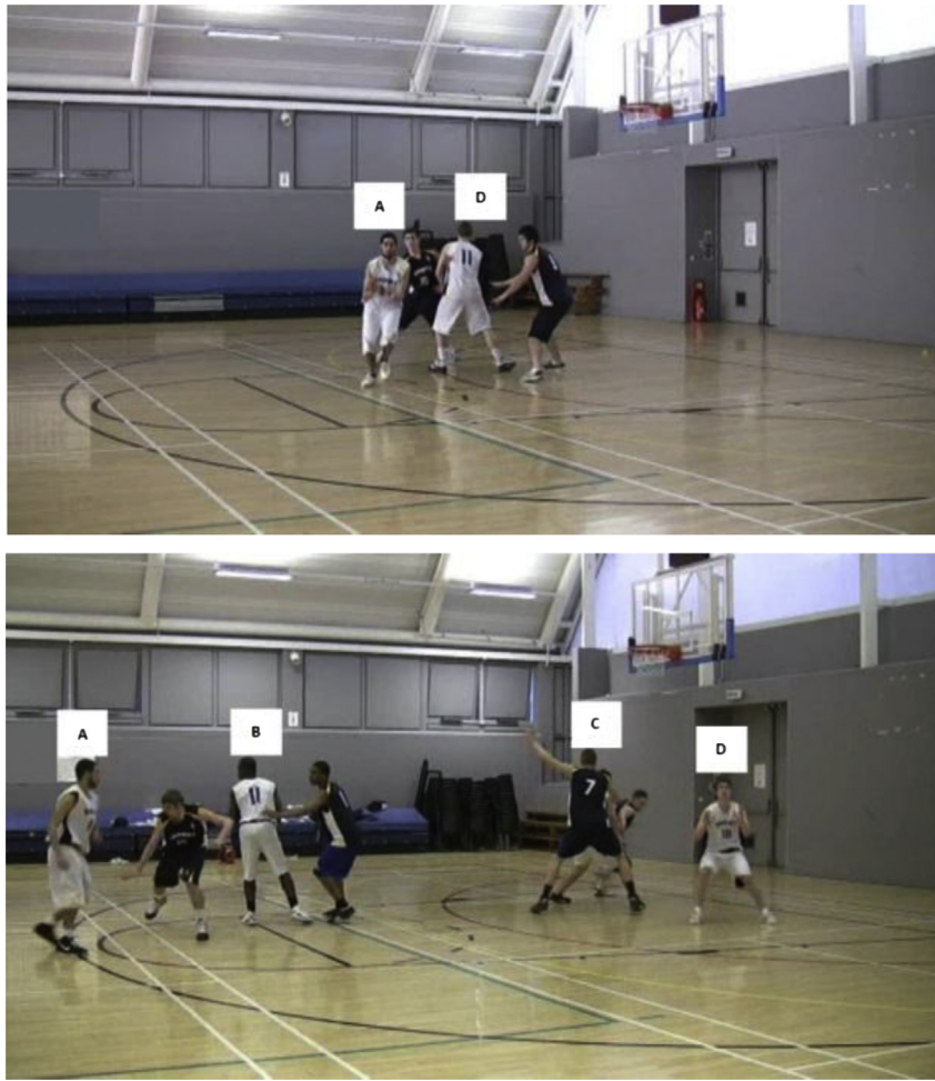
Fig. 1. Video stills depicting the design of the video stimuli used for the low-complex, two-choice response time (upper panel) and high-complex, four-choice response time (lower panel) tasks.

The task was designed and run on E-Prime (v. 2.0.1; Psychology Software Tools, Inc., Pittsburgh, Pennsylvania, US). Video sequences were presented on a computer screen viewed from a distance of approximately 0.5 m. Participants responded to each sequence by pressing one of two (low-complex trials) or four (high-complex trials) buttons positioned horizontally on a handheld response pad corresponding with players' on-court position (see Fig. 1).