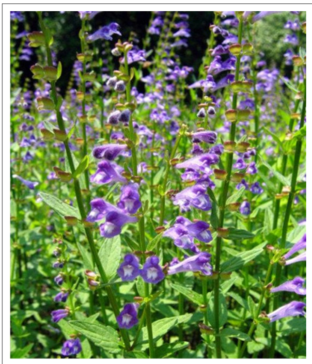
Figure 1. Scutellaria barbata D.Don.

aspect of S. barbata . Moreover, phytochemistry studies have isolated and identified from S. barbata over a hundred metabolites with medicinal value. Antibacterial activities, anti-oxidant, liver protective, and immune regulation functions were also characterized in many in vitro or in vivo models. One of the most significant outcomes of all this knowledge, which may yet translate to the clinical application of S. barbata in cancer treatment, is the development of BZL101 for breast cancer patients beyond China.