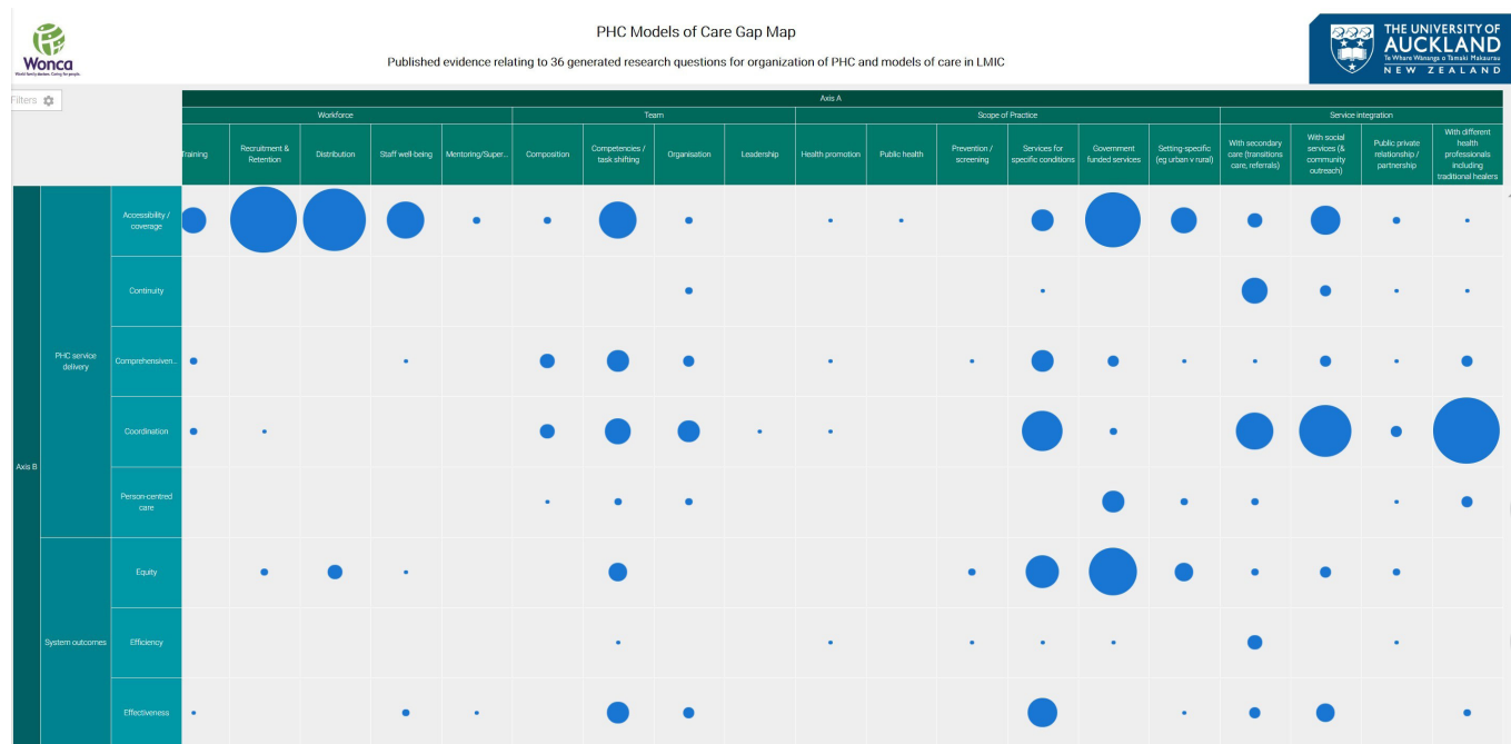
Figure 3 Static version of gap map of studies for model of care.

question were coded for two axes. Seven global regions (Europe, Eastern Mediterranean, Asia Pacific, South Asia, Africa, North America, South America) and a list of all LMICs were included as filters for the map.