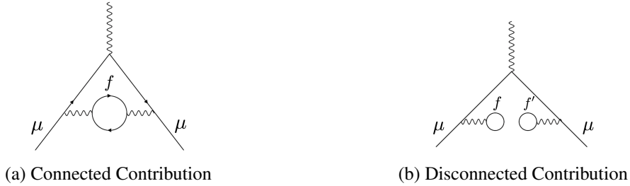
Figure 1: The Feynman diagrams for the contribution to a_\mu from the leading-order HVP. The quark loop in (a) is radiatively corrected by virtual gluons and sea quarks (not shown). In the same way, the quark loops of flavor f and f' in (b) are connected by virtual gluons and sea quarks (not shown).

with k = 1, 2, 3 and J_k = i \sum_f Q_f \bar{\Psi}_f \gamma_k \Psi_f with f = u, d, s, c . Here, Q_f is the charge of the quark of flavor f in units of the electron charge e . The correlator can be divided into two parts: connected and disconnected. Fig. 1 shows the schematic diagrams associated with these two pieces.